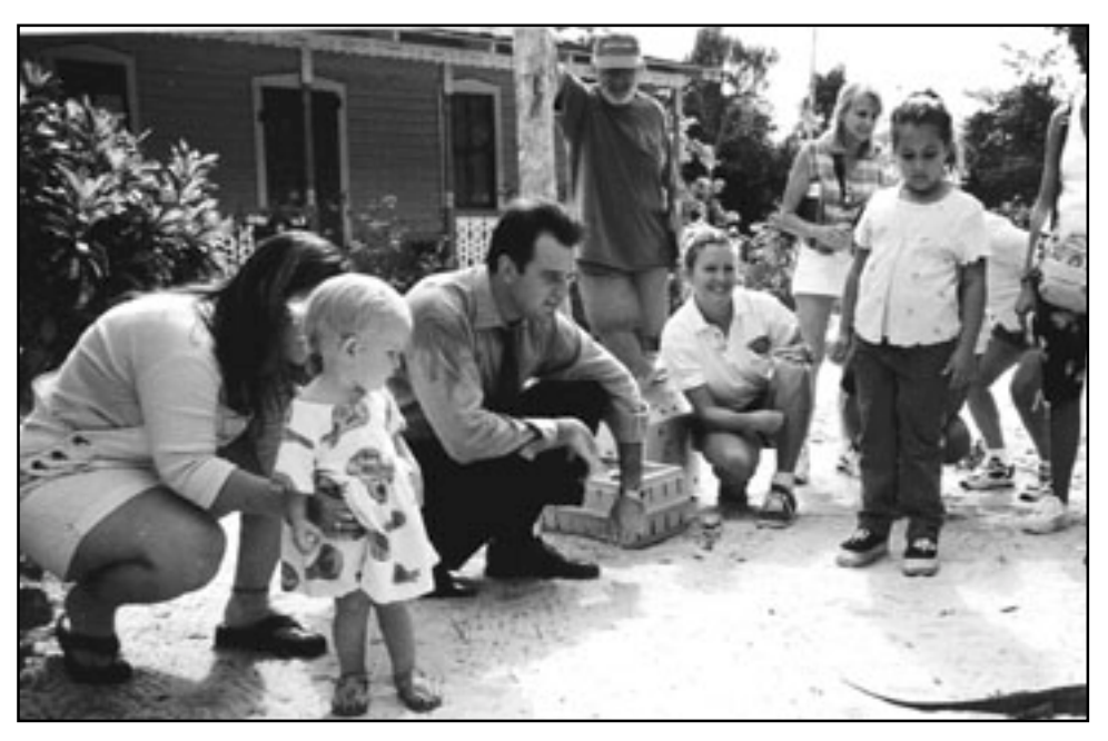
A young captive bred blue iguana sees her first taste of freedom, watched by sponsors and National Trust supporters