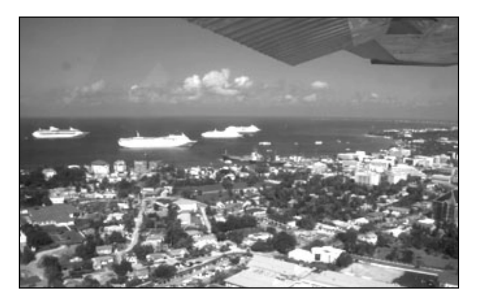
Cruise liners and the pressure for built development obotal for the leisure and offshore banking industries place heavy pressures on Cayman's natural resources. George Town

Government may find that many members of the public will think the way the backbenchers apparently do, that the fund was to provide additional funds earmarked to be utilised for protection of the natural environment, perhaps for the purchase of Central Mangrove Wetlands or similar purposes. It is apparent that government is under sever strain in their effort to balance the budget. Instead of attempting to achieve that balance by subterfuge, they could have stated the problem clearly and drawn on the combined good will of the Finance Committee, the civil service and the population at large, in a search for a solution. This might have garnered wide support. An attempt to minimise the difficulties and to quietly divert funds from their true purpose will tend to reap the public's ire when a joint effort is needed to bring government finances