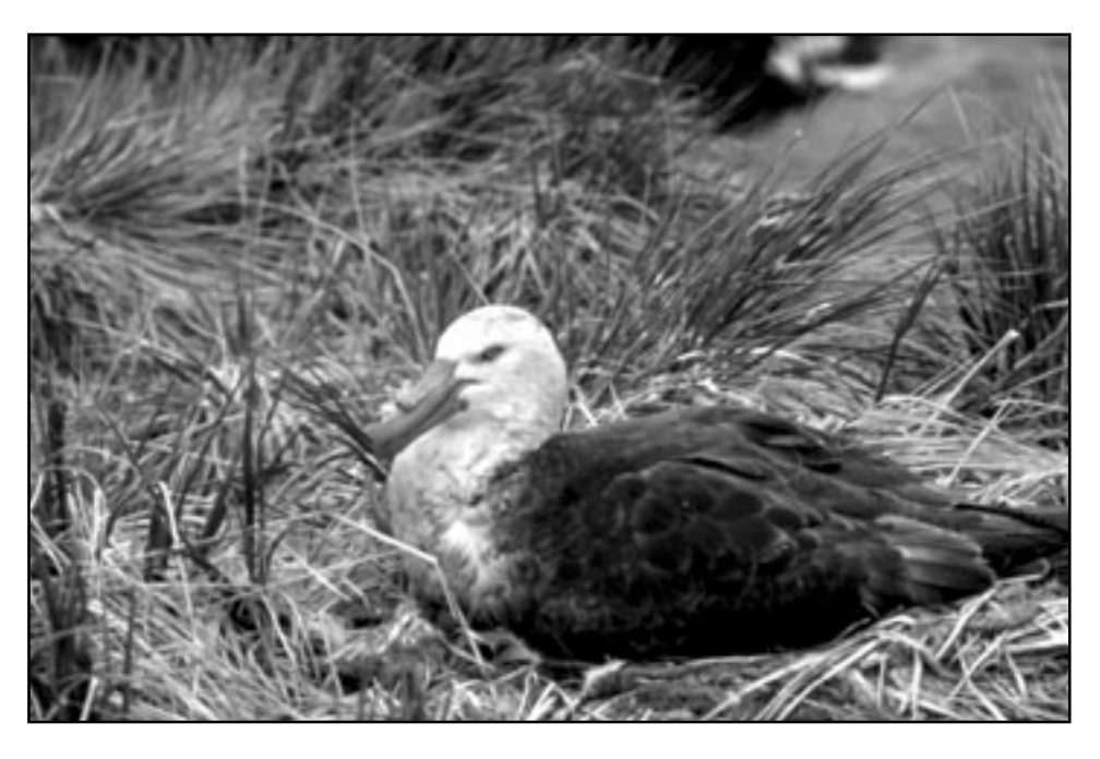
Southern Giant Petrel Macronectes giganteus at nest South Georgia

Albatrosses and petrels now listed in Appendix II