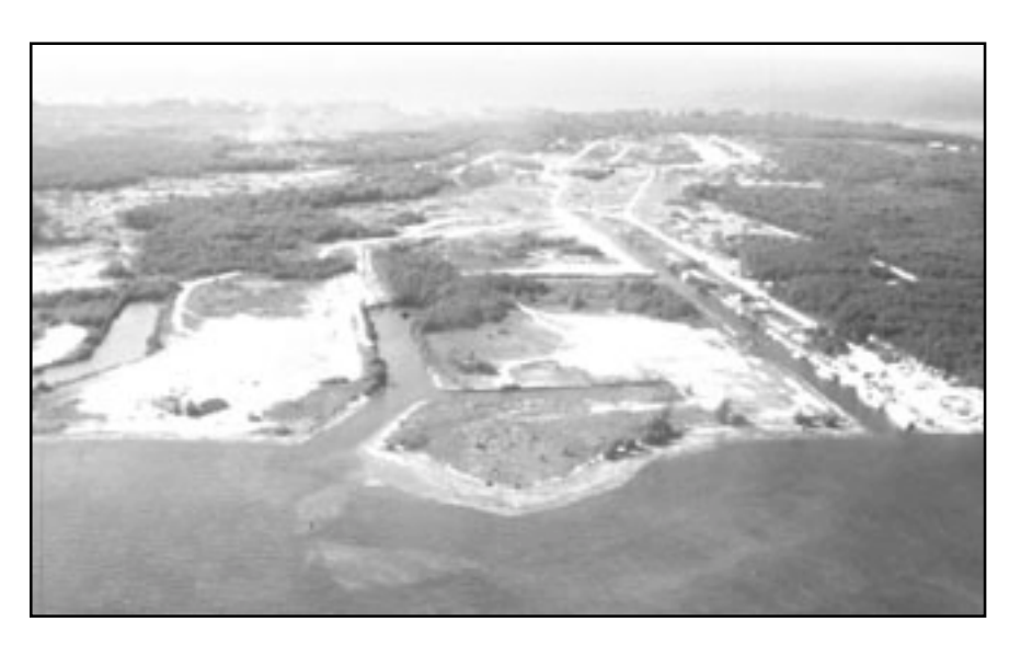
Dredged "borrow pit" in North Sound Grand Cayman. Dredging marl from the shallow water marine environment in North Sound, to provide fill to destroy mangrove wetland for real estate development, has generated huge fine sediment loads which are also stressing coral reefs

Tempers rose in finance Committee yesterday when members did not receive a list of environmental projects to be financed from the budgeted figure to be taken out of the fund. Instead the committee heard a government proposal that $5.9 million from the fund was to be transferred to general revenue to be used mostly to cover recurrent expenditure of the