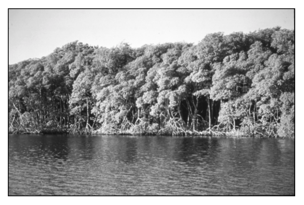
Red mangroves Rhizophora mangle at Booby Cay, North Sound, Grand Cayman

Members could air their views. But because Government did not respond to everything that was said did not mean it agreed with the views and that the person was right. It only meant that the person had a view on the subject.