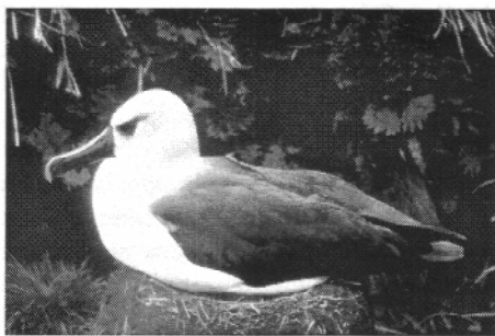
Yellow nosed albatross Diomedea chlororhynchos identified as a flagship species for research on Gough Island.

The following flagship species were identified, based on knowledge of their vulnerable conservation status; three species of albatross (especially the near-endemic wandering albatross), the southern giant petrel, the two endemic landbirds (a moorhen and a bunting) and the southern elephant seal. With the exception of the l