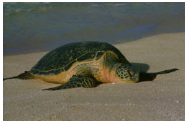
Female green turtle hauling ashore on Henderson's East Beach