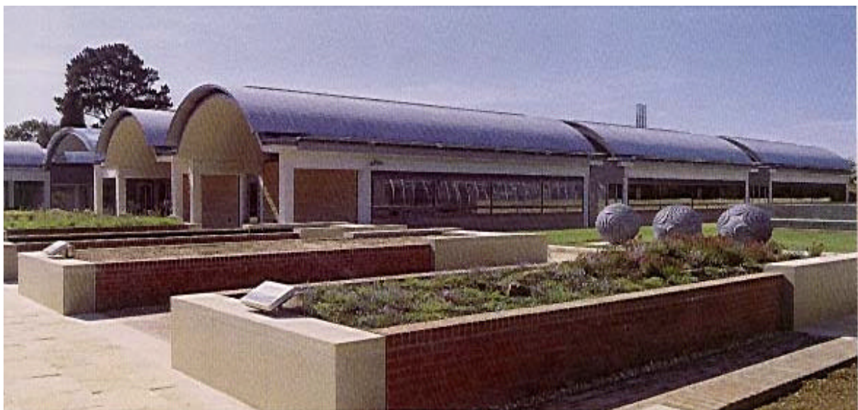
The Wellcome Trust Millennium Building, designed to house the new Millennium Seed Bank, as well as offices, laboratories and a public exhibition area