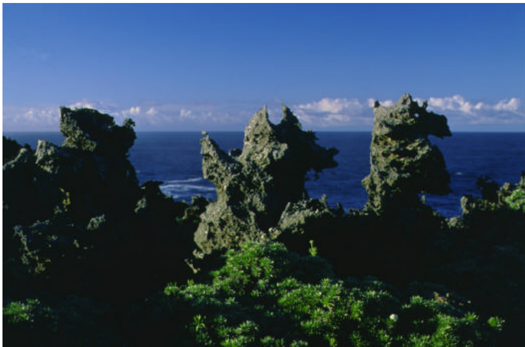
The south-western coast of Henderson is dominated by fabulously eroded makatea limestone.