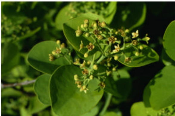
Santalum insulare var. henderonense , a variety of sandalwood endemic to Henderson

In summary therefore we find that some conservation progress has been achieved (e.g. Objective (viii)) without the benefit of the Plan. Other objectives (e.g. Objective (v)) have not been achieved and would very likely be advanced within the framework provided by the Plan. Moreover, an agreed Management Plan for this World Heritage Site would provide a structure within which any future threats to the ecological marvels of Henderson could be assessed.