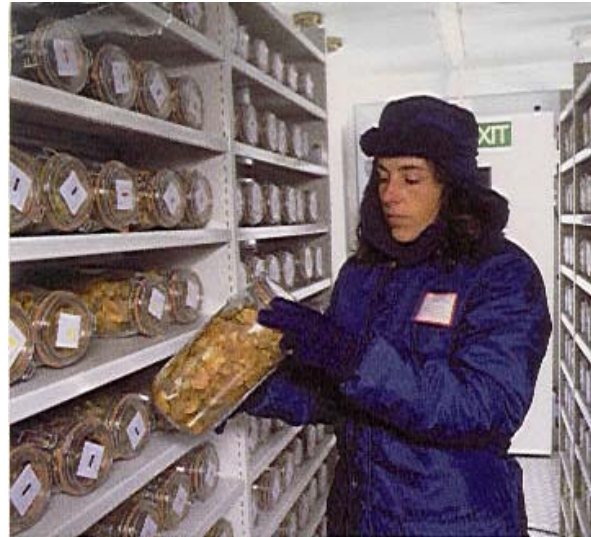
Seeds are stored at sub-zero temperatures