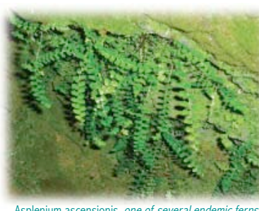
Asplenium ascensionis, one of several endemic ferns which constituted Ascension's original moutain-peak cloud forest.

n 1999 the UK Government issued the Overseas breeding seabirds to Ascension itself. Territories White Paper 'Partnership for Progress and Prosperity.' This recognised that responsibility for environmental issues in the Overseas Territories rested with the local governments, but that the UK Government had responsibility to support these local efforts. This concept was embodied in the Environment Charteres; Ascension's Charter was signed by the UK Minister for the Overseas Territories and by the then Administrator Geoffrey Fairhurst on 26 September 2001 (see centre pages of this brochure). The Charter includes guiding principles and a set of mutual commitments by the UK Government and the Government of Ascension Island in respect of integrating