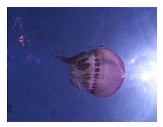
Jellyfish found in the waters around the Chagos

The rat-free islands of the great Chagos Bank including Nelson, Three Brothers and Danger islands are teeming with birds and other wildlife. Shearwaters and brown boobies have moved into Nelson. At least 18 (threatened) white-tailed tropic birds were seen in the Salomon atoll. Even on Diego Garcia itself, the Royal Naval Bird Watching Society counted no fewer than 3340 pairs