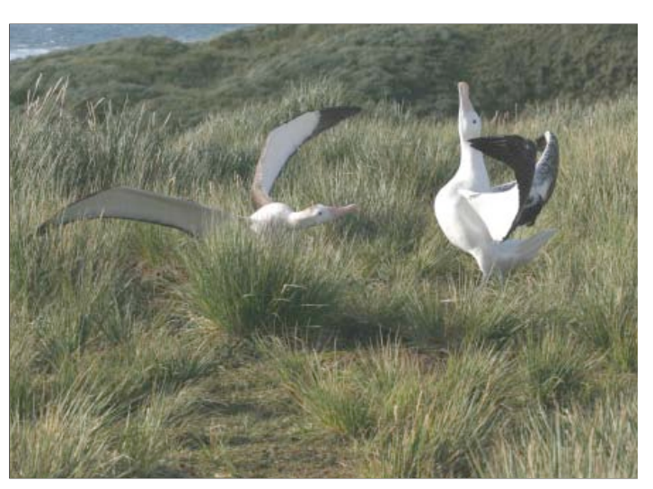
Wandering albatrosses display on breeding grounds at Prion Island, South Georgia

in Falkland waters. Tristan da Cunha endemic species remain severely threatened by illegal commercial fishing. The Group was delighted to hear that, in February 2006, local legislation here was updated to comply with the international Agreement for the Conservation of Albatrosses and Petrels, with Tristan being included within this Agreement shortly after the end of the reported year. On Ascension Island it was good to hear that there had been no reports of feral cats all year, and even better to learn of seabirds beginning to recolonise previously abandoned mainland breeding areas. An International Workshop held in the Falkland Islands in March, to address albatross and petrel conservation in the Overseas Territories, provided a unique opportunity to draw up a detailed programme of positive action required to address the dramatic seabird declines across the South Atlantic. The Group hopes to assist in taking forward some of its wideranging recommendations next year.