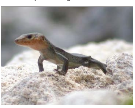
Endemic Bermuda skink

previously unaddressed need to promote and coordinate conservation of the diverse and increasingly threatened plant and animal species and natural habitats in the UKOTs.