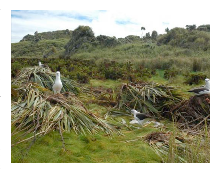
Yellow-nosed albatross sitting on flax, that has been cleared with help of OTEP funding, Nightingale Island

There are many important and urgent conservation needs in the UKOTs. Each UKOT has different priorities and different legislation, making each unique. It is for each Territory to work on their priorities and for the Forum to help in this process, as well as in helping design means to address these needs, help in finding funds, and co-managing projects. Following the pilot work in Turks and Caicos Islands, UKOTCF facilitated the development of a strategy to implement St Helena's Environment Charter. The Environment Charter strategy processes continue to develop reasoned