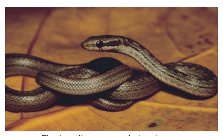
The Anguillan racer snake is unique to Anguilla and important to biodiversity

In addition to activities in individual UKOTs (outlined below), a number of initiatives involving cross-Territory partnerships have been progressed by current and former Forum members, and by the Forum itself. Fauna & Flora International (FFI) are engaged in a review of cruise ship activity and its impacts in the Caribbean region. Much