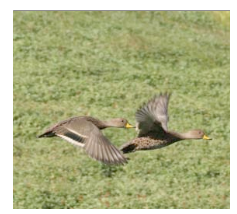
Endemic South Georgia pintails near Grytviken, South Georgia

The Forum was established in 1986, as an unincorporated institution, when a number of UK-based science and conservation organisations recognised a