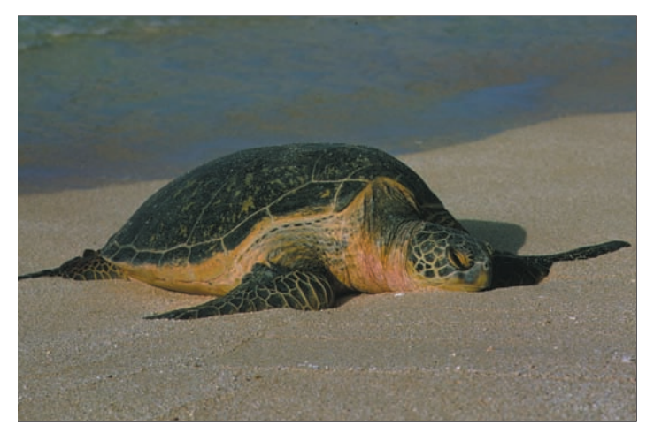
A female green turtle returns to the sea after laying; conservation has restored Ascension's population to the second largest in the Atlantic

HMG accepted the report and, in 2001, announced their decision in favour of the "public finance" option. A first Council was elected. Some businesses were sold to local inhabitants. UK and local conservation bodies invested heavily in conservation projects. Late in 2005, there were signs of uncertainty over the crucial "right-of-residence" point. At the end of November, HMG personnel visited Ascension and announced to Ascension's newly elected second Council an intended reversal of HMG policy, without any prior consultation. Conservationists were very concerned that the major, and so far highly successful, programme of work based on the earlier plan for the future would be