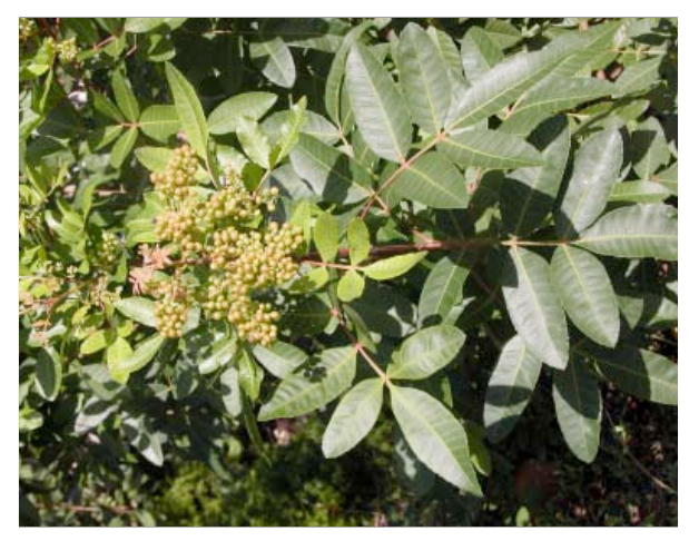
The invasive Brazil pepper found through out the Caribbean

the foundations for the next implementation phase of the biodiversity and sustainable development plan, focusing on further education and awareness-raising activities, and the development of within-country ecotourism. This is receiving support from OTEP, which is also funding work on new environmental legislation to aid TCI's joining of CITES and the Convention on Biological Diversity. Despite these (and other) positive developments in TCI, concerns have been brought to the Forum's attention during the year over damage to salinas on Grand Turk (areas of international importance for birds) and the need to give them protected area status, potential negative impacts of the opening of a cruise liner dock in Grand Turk, and aspects of a TCI Government review of Protected Areas.