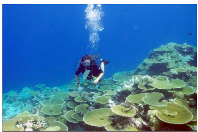
Acropora cytherea, coral recovery in the Chagos reef previously badly damaged by warming in 1998