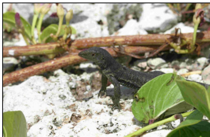
Sombbrero Black Lizard, found only on this small island. UKOTCF congratulates the Government of Anguilla on its decision, based on work over several years, to make Sombbrero a Protected Area.

Although the Anguilla Ecotourism project has successfully trained a number of tour guides, it was not possible for bus tours to take place during the last tourist season, due to factors beyond the project's control. Marketing and promotion are currently underway to ensure bus tours are conducted next tourist season. Two 2-day teacher training workshops, focusing on wetland environmental education, were run successfully in Anguilla in December 2004. The workshops, funded by RSPB, were based largely on the work of the West Indian Whistling Duck and Wetlands Conservation Project, managed by the West Indian Whistling Duck Working Group (WIWDWG) of the Society for the Conservation and Study of Caribbean Birds (SCSCB). The ANT did a superb job planning and