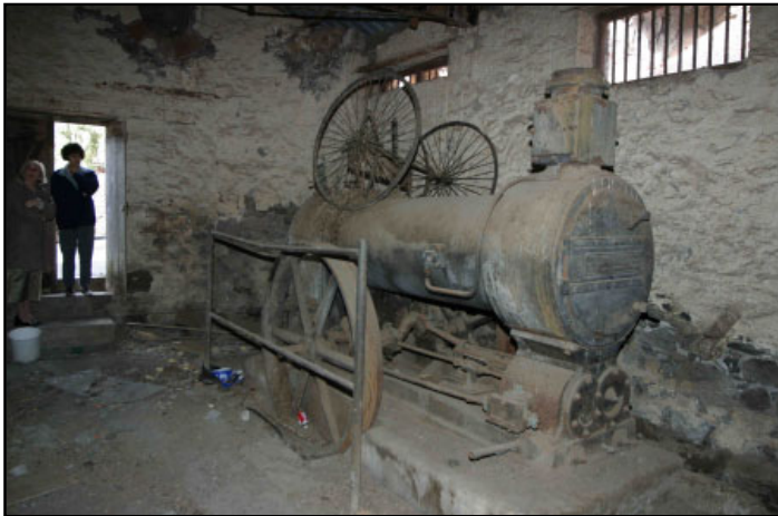
Inspecting the historic building and steam engine that will form key parts of St Helena's flax museum.