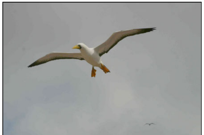
Masked Booby drops into its nesting site on mainland Ascension.