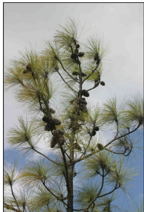
Caicos Pine - the national tree species under threat possibly due to diseased imported alien trees.

During the year, considerable progress has been made towards further implementation of the Biodiversity Management Plan, including through work supported by OTEP. Further field-roads have been developed on North and Middle Caicos, and the first of these was officially opened in June 2004 by the Hon Jeffrey Hall, a Government Minister and Middle Caicos representative to the Legislative Assembly (see Forum News 25). January 2005