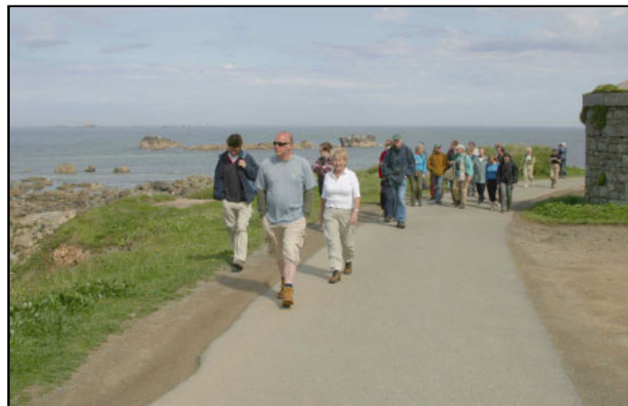
Alderney Wildlife Trust field trip for residents and visitors beside proposed Ramsar Convention Wetland of International Importance

French Committee enlisted the help of IUCN Europe Office to host a small meeting of representatives, including also from the Dutch and Spanish IUCN Committees. This resulted in constructive discussions, leading to progress for OT conservation in the EU, IUCN and elsewhere. At the recommendation of this meeting, the Forum has proposed that it should take the UK lead in conservation