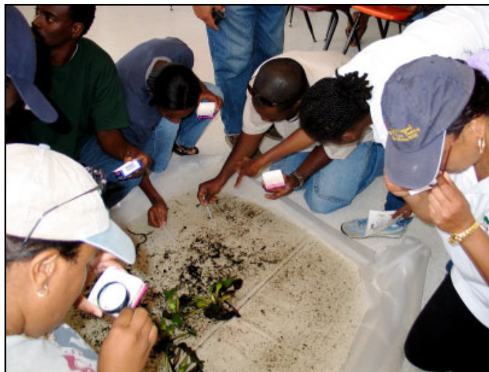
BVI schoolteachers learn techniques to teach about wetland invertebrates in the "Pour-a-Pond" activity at a wetlands education training workshop 2005.

Regular reports during the year indicated that the Darwin project towards Assessment of Coastal Biodiversity in Anegada is progressing extremely well, based on a dynamic partnership between MTRG, RBG Kew, RSPB, the BVI National Parks Trust, BVI Conservation and Fisheries Department, and the H.Lavity Stouff Community College. Some of the botanical outputs from the project, including a display of BVI plants organised by RBG Kew and the Eden Project at the 2004 Chelsea Flower Show (as part of an exhibition of island endemics), are reported in Forum News 25. The regular newsletter produced by the project is available at www.seaturtle.org/mtrg/projects/anegada/