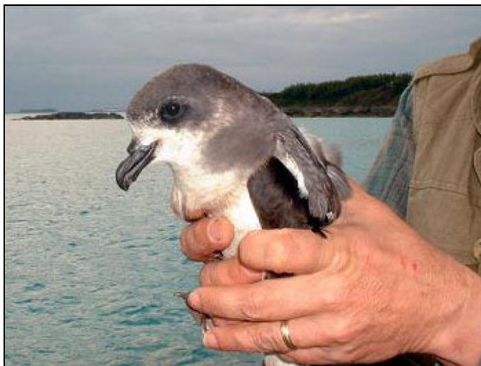
Cahow caught as part of the study informing conservation measurers.

There was further concern in 2004/05 over the environmental impact of quarrying on important and vulnerable cave ecosystems in Bermuda. However, objections to these activities appear to have halted potentially damaging operations.