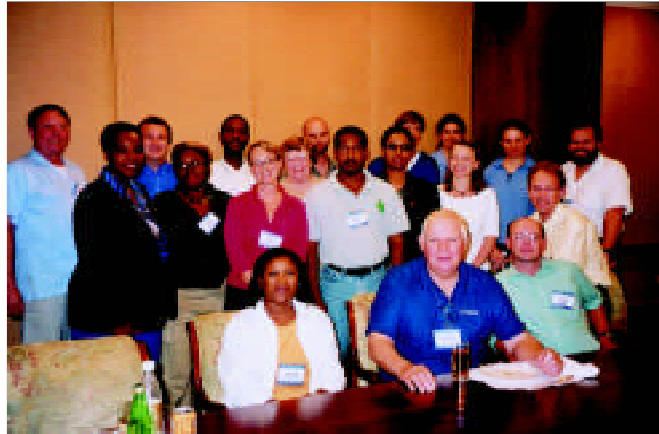
Some members of the Wider Caribbean Working group meet for discussion at the conference in Bermuda