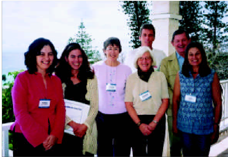
Some members of the South Atlantic Working Group meet for discussion at the conference in Bermuda

Seabird issues feature strongly in efforts to protect the wildlife of the Falkland Islands where legislation has now banned the traditional collection of albatross eggs.