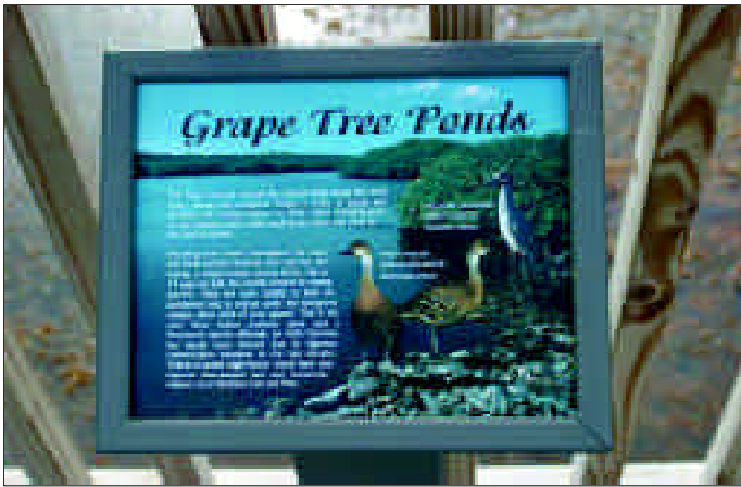
Enameled ceramic interpretative sign for Grape Tree Ponds, Little Cayman