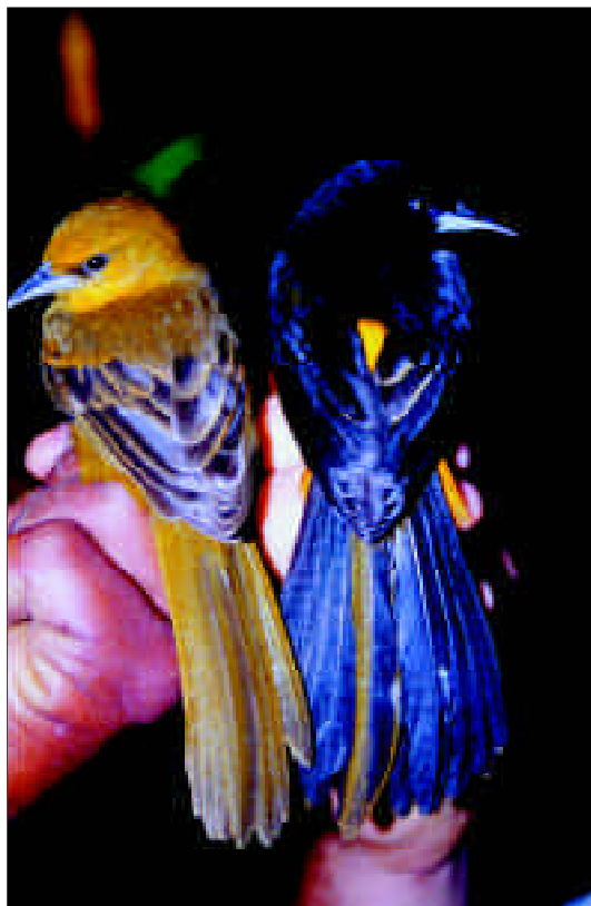
Montserrat Oriole, Icterus oberi

The FCO-funded project on emergency conservation of the Montserrat Oriole , conducted by RSPB, MNT and the Montserrat Forestry Department, is now into its third year. Research continues to focus on identifying the cause of the recent decline. The picture that is starting to emerge is of three particular problems. First, major ash-falls almost certainly reduced the insect food supply during 1997 and 1998. Second, the rat population explosion in 1999-2001 led to very high rates of nest predation, while concurrent increases in a predatory native bird – the pearly-eyed thrasher – added to predation pressure. Finally, drought in 2001, and to a lesser extent in 2000 and 2003, appeared to reduce oriole breeding effort. Researchers are currently wrestling with the problem of predicting the circumstances under which rat numbers might return to high levels, or insect numbers might drop in