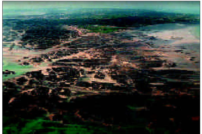
The important intertidal area at the SE of Jersey is already a Ramsar site; the Forum is advising Jersey colleagues on extensions and additions

The Department for International Development (DFID) announced at last the start of its fund (which had been previously provisionally named the Global Environment Programme for UKOTs). Despite the 4-year delay since originally announced in 1999, this is nonetheless welcome,