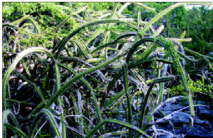
The scrambling cactus Leptocereus quadricostatus growing on limestone cays in Anegada

The Island Resources Foundation (IRF) completed a Resource Characterisation and Management Plan of the privately owned island of Sandy Cay, in order to address future management requirements, which may include the NPT.