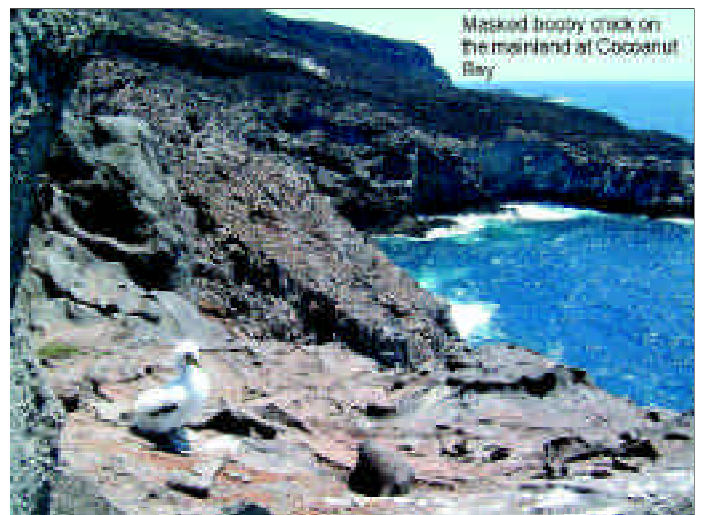
One of the first Masked Booby chicks to be reared on the main island of Ascension for over a century, following conservation action

As with other Territories, large scale commercial fisheries pose a major threat to the internationally important seabirds of Tristan da Cunha. With very limited resources adequately to patrol these activities, birds continue to die at unacceptably high rates. The spread of introduced species is another serious problem to the many native and endemic species in the Tristan group, the most remote islands in the world. The removal of flax from Inaccessible Island is planned for the near future. We have also been actively pressing for the extension of the World Heritage Site at Gough Island to include Inaccessible Island, and look forward to its confirmation soon. Improvements in communications would be an enormous help in supporting conservation efforts on Tristan. We strongly urge all who can play a constructive part, in reducing the huge cost and the access problems of communications with the wider world; to tackle this issue with some urgency. For the future, we strongly support the RSPB Darwin Initiative Project Managing Biodiversity on Tristan da Cunha due to take place over the next three years, and offer every assistance to make this the success it deserves.