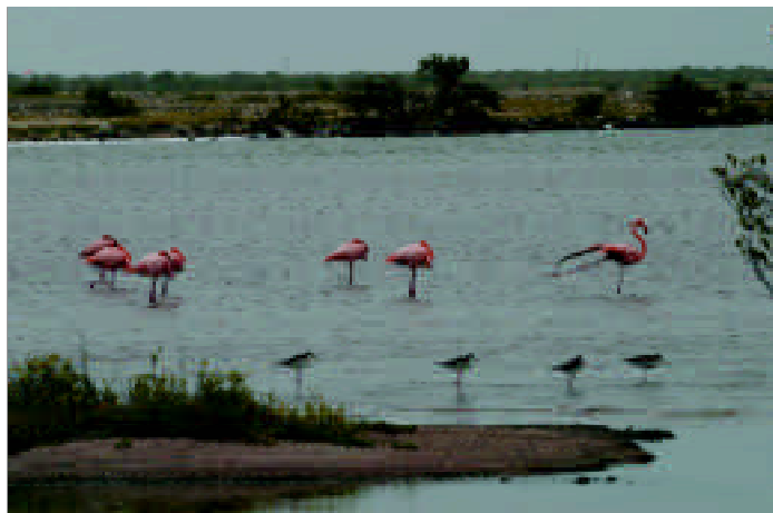
Flamingoes and Stilts are popular sights on the salt-pans beside some towns in Turks & Caicos, but some pans are being in-filled to hold new buildings. The process to implement the Environment Charter provides ways to help people decide between options for future developments.

The Forum and its member organisations have been involved in a number of biodiversity and planning initiatives. Widespread recognition, across Bermuda, of the need for a coordinated community-based plan for the conservation of the Island's unique natural heritage