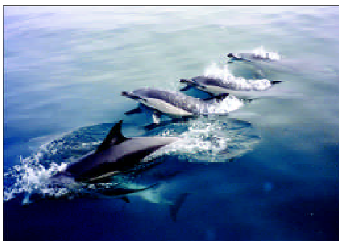
Many dolphins are caught as an unintended result of fishing activities

One area not presently covered by working groups is the Cyprus Sovereign Base Areas, where progress is noted in the designation by the Ministry of Defence (MoD) of a