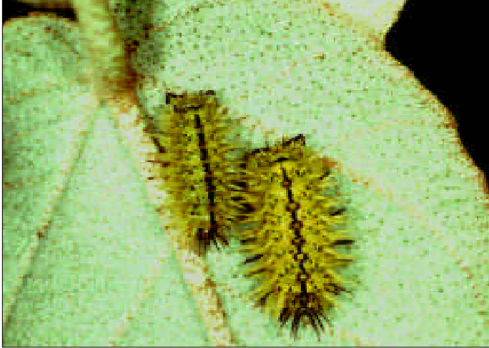
The Spiky Yellow Woodlouse is an amazing little creature found on the endemic plants at High Peak. It has been called a 'living fossil' because it is an ancient species.

The Group continues to place a high priority in supporting conservation efforts on St Helena. We have closely followed the proposals for an airport development,