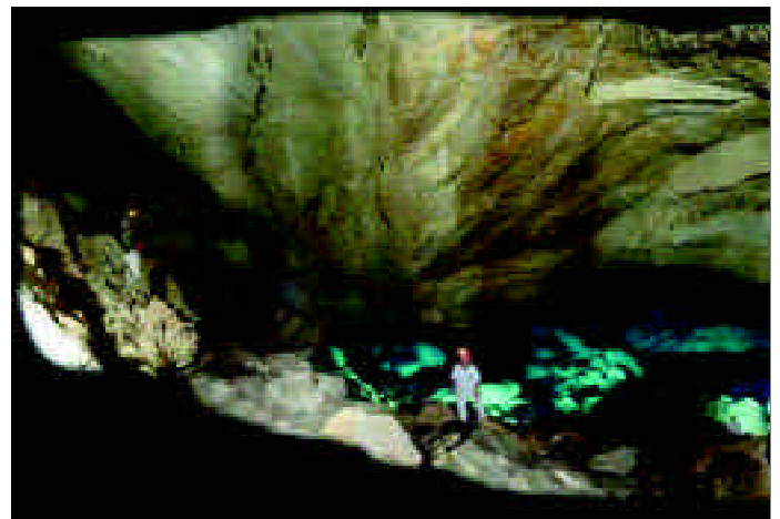
Part of Bermuda's rich but threatened cave system

The Bermuda Audubon Society has acquired two new reserves, thanks to the generosity of local landowners. The