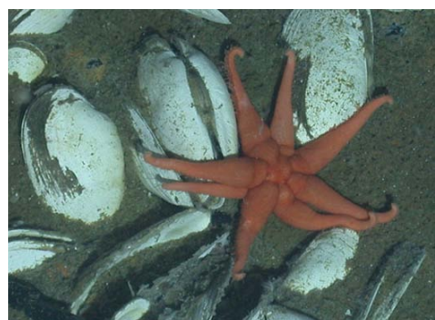
Eight-armed starfish on the East Scotia Ridge.

The British Antarctic Survey has continued to conduct much scientific research. One research expedition, being led by BAS in conjunction with scientists from the Scientific Committee for Antarctic Research (SCAR), is the South Orkneys – State of the Antarctic Ecosystem project. This started in August 2015 and is due to end in August 2016. The expedition itself took place in early 2016 and involved researching the biodiversity both within and outside the newly established South Orkney Islands Southern Shelf Marine Protected Area. In April 2015 an article reported the discovery of new deep-sea starfish family: Paulasterias tyleri , found in the waters surrounding a hydrothermal vent in the East Scotia Ridge.