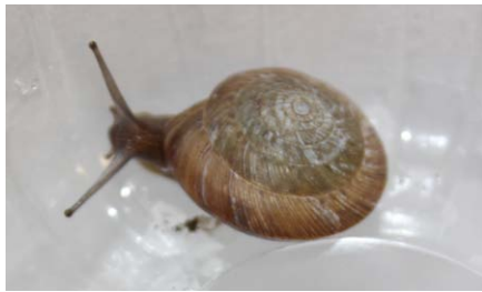
Bermuda land snail Poecilozonites bermudensis, thought extinct but recently rediscovered in the centre of an urban environment.