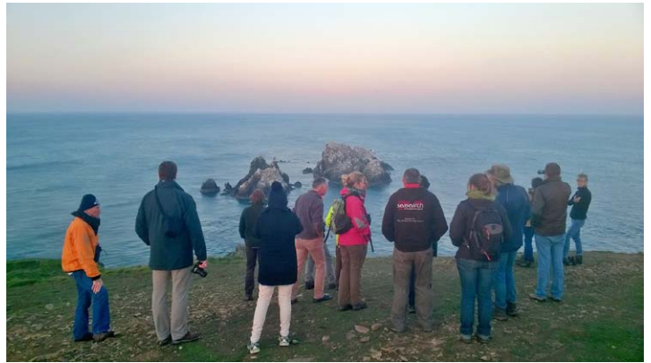
Participants in the annual Inter-Island Environment view part of Alderney's Ramsar Convention Wetland of International Importance.