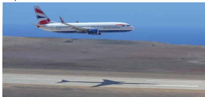
Boeing 737 of Comair, in British Airways livery, on its trial flight over the runway at St Helena. So far, wind-shear problems have delayed the introduction of scheduled flights.

Regarding marine resources, a fisheries science protocol was developed and a marine environment tourism accreditation scheme was written, consulted on and approved by the Environment and Natural Resource Committee. Marine life interaction guidelines were produced and consulted on. Training plans and other literature were also produced. Work commenced for ecosystems service assessment. Various monitoring programmes and surveys were carried out. Whale shark research was completed.