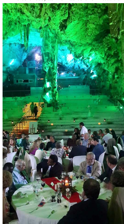
More views from the conference: the closing dinner in St Michael's Cave inside the heart of the Rock, with the Gibraltar Corps of Drums.

UKOTCF has, for some years, tried to encourage a strategic approach