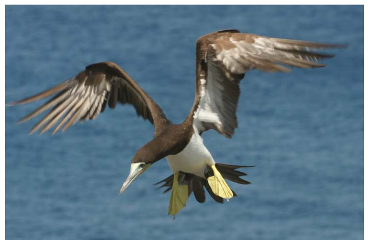
Brown booby about to land on the cliff-top at the breeding colony on Sombrero.

In addition to the above, Anguilla is taking forward its first Ramsar site designation of a Wetland of International Importance under the Ramsar Convention, for the island of Sombrero. This is important, amongst other things, for seabirds and an endemic lizard. There are critical threats on the mainland of Anguilla to the Lesser Antillean iguana, and a re-introduction programme is being considered. As a result of WCWG's circulation of the GCRMN request for information, Anguilla Fisheries Department had responded, and been invited by the project co-ordinator SPAW-RAC to join the GCRMN-Caribbean initiative Basecamp Forum.