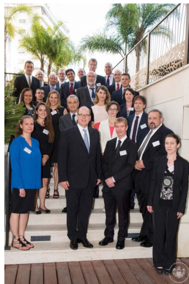
The Monaco Assessment Group, with HSH Prince Albert II of Monaco.