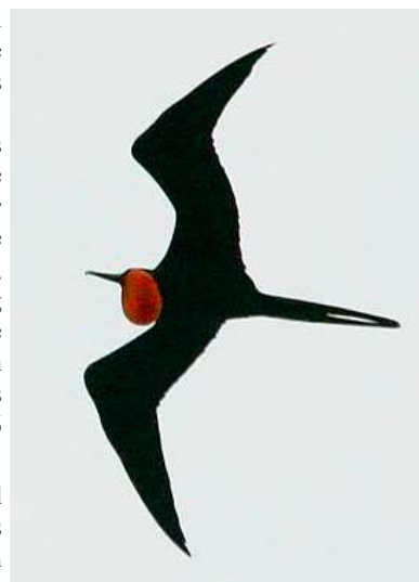
Flying male frigatebird showing inflated display throat pouch.

The Island has recently featured on an episode of BBC Radio 4's Costing the Earth series, which covered among other aspects, the greening of Green Mountain and the work being carried out to address invasive species issues.