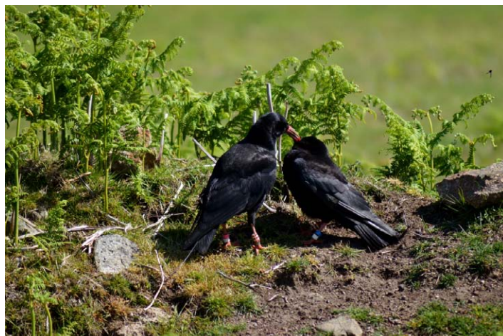
Choughs on Jersey.

A collaboration between States of Jersey, National Trust for Jersey and Durrell Wildlife called Birds on the Edge has had success with the return of breeding chough Pyrrhocorax pyrrhocorax to Jersey; for the first time in 100 years there has been a wild chough chick bred on Jersey – this has taken 5 years since the initial release of choughs on the island.