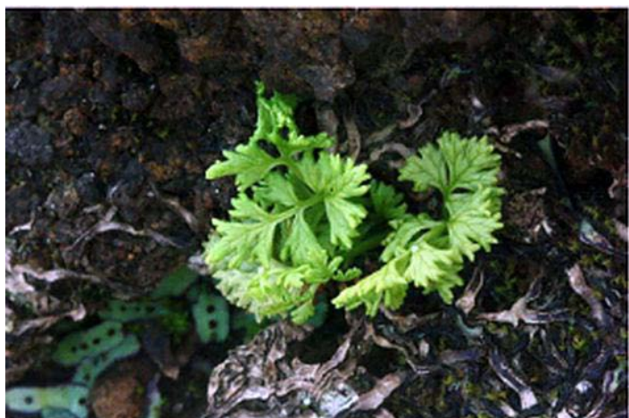
Ascension Island parsley fern Anogramma ascensionis .

The start of 2016 saw the exciting announcement of the forthcoming creation of a marine reserve around Ascension Island, which will be 234,291km 2 . An area of 52.6% of Ascension's waters will be closed to fishing, and policing of a tuna-fishery will be carried out in the other 47.4%.