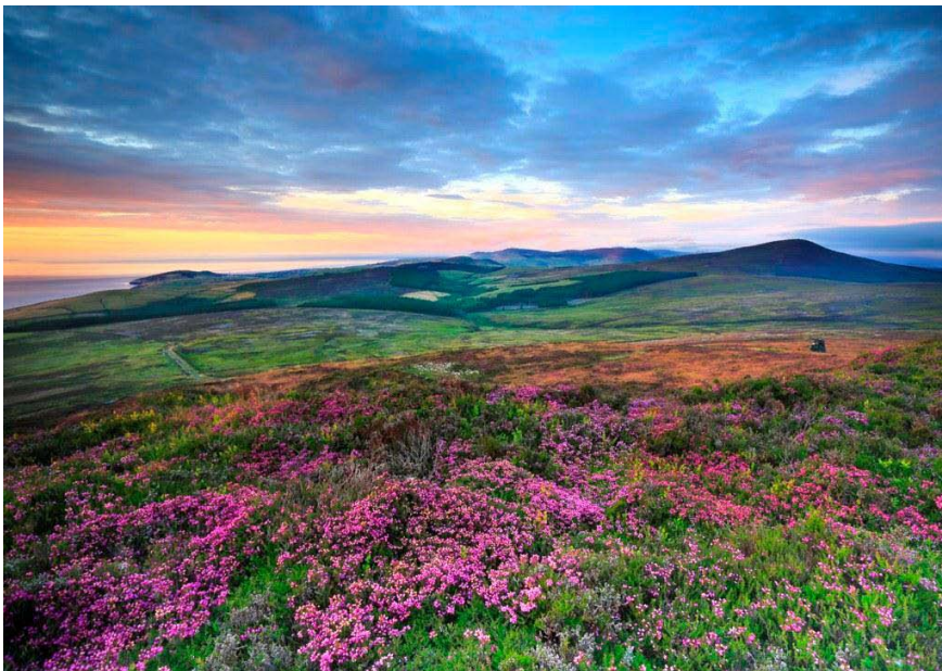
Hill of the Isle of Man, part of the whole-island Biosphere.

In March 2016, the island and the territorial waters around it were adopted into UNESCO's network of Biosphere Reserves. Biosphere Reserves are learning sites for sustainable development, promoting solutions which reconcile the conservation of biodiversity with its sustainable use. Reserves are nominated by national governments and remain under the sovereign jurisdiction of the states where they are located.