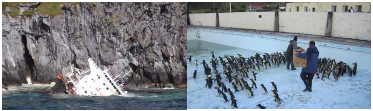
Part of MS Oliva, broken up against the immensely important wildlife island of Nightingale and islanders at Tristan attempt to clean and release oiled Rockhopper Penguins, held in the island's swimming pool. It is unclear why the modern ship hit the island if the crew were on watch. Sadly, most penguins did not survive, and several endemic species were badly affected too.