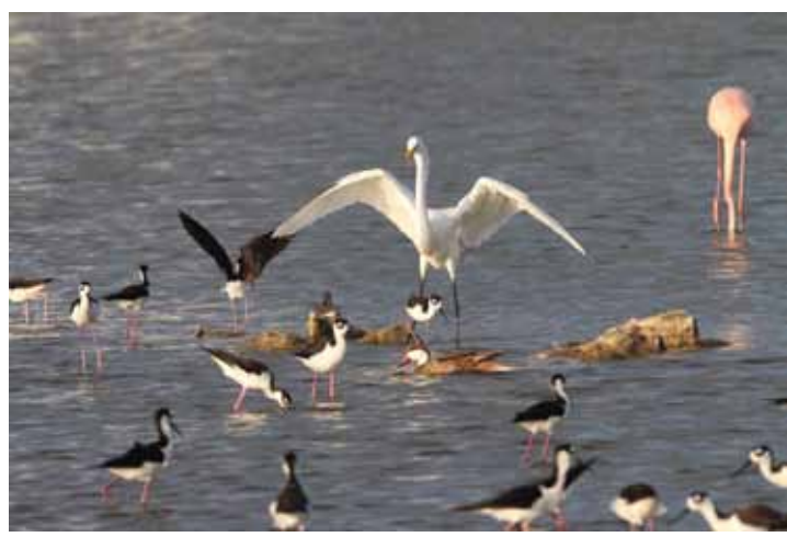
Flamingo, Great Egret, Black-necked Stilts and White-cheeked Pintails feed in Red Salina, Grand Turk, recently protected and featuring in the new UKOTCF/ Turks & Caicos National Museum nature trails.

WCWG was pleased to hear of excellent progress under UKOTCF's OTEP-supported Wonderful Water curriculum development project (in conjunction with the TCI Education Department), and noted the potential of this project to provide a template for environmental education activities in other UKOTs. RBG Kew continued its valuable work with TCI partners, in plant red listing, seed banking and under the Caicos Pine Recovery Project which received very welcome support from OTEP in 2010. Visits to TCI by UKOTCF personnel during the year helped to strengthen WCWG linkages, including through the recruitment of the Turks & Caicos National Museum and the TCI Reef Fund