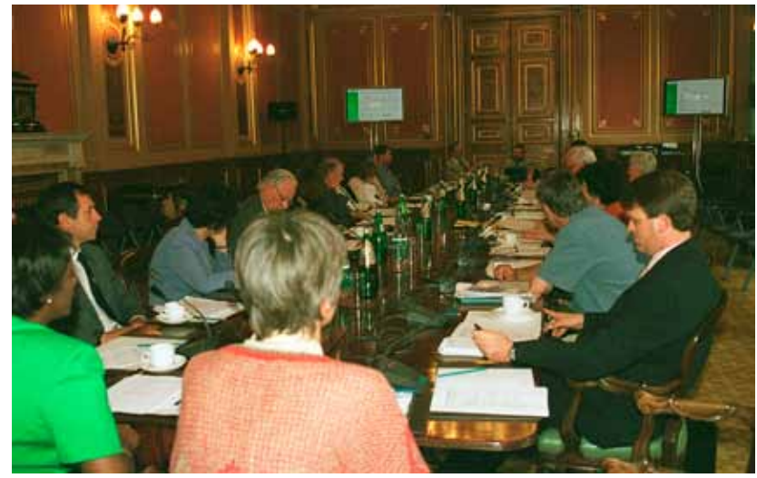
From a time when UK Government liked to share the expertise of the NGOs. UKOTCF then Chairman and a senior FCO official jointly chair one of the twice-yearly joint meetings between UKOTCF, its member organisations, UK Government departments, and UK Overseas Territories UK representatives.

The new UK Government's freeze on spending had an immediate and disappointing impact on the UKOTs. For several years, UKOTCF has hosted a set of web-pages through its website, to disseminate information for the FCO/DFID joint Overseas Territories Environment Programme (OTEP). This agreement meant that project reports and articles relating to OTEP projects were reported in Forum News . This meant that the Programme's value was readily demonstrated and its results made widely available, both topically and readily found later by structured searches. The public announcement of a freeze on new communications spending (in any media) for 2010/11, may be extended further. In addition, DFID received specific (and not time bound) instructions from Cabinet Office on websites, namely that they cannot commission third parties to build or continue independent project websites. They have instructed that any