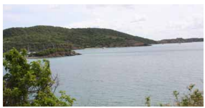
Jost Van Dyke.

WCWG has been delighted to hear reports of conservation work on-going in BVI, including under the auspices of the Jost Van Dykes Preservation Society (JVDPS, which became a UKOTCF Associate organisation in 2010) and the National Parks Trust of the Virgin Islands (formerly the BVI National Parks Trust, a long-standing UKOTCF Member organisation which celebrates its 50th anniversary in 2011). JVDPS activities include environmental education initiatives, as well as work to control invasive species including feral cats, mongooses and non-native plants. RBG Kew has maintained its strong links with partners in BVI, including through visits to conduct survey work which this year extended