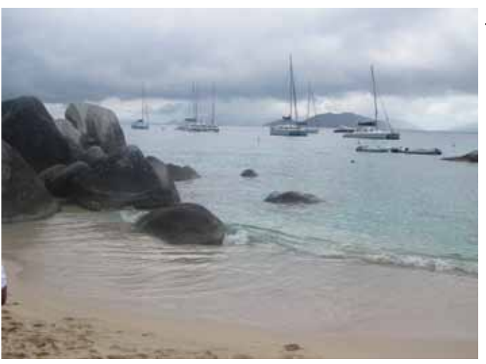
from the general ongoing activities The Baths National Park, Virgin Gorda, British Virgin Islands, is during the reporting period the one of the sites being addressed in the MPASSE project. Here, the Forum has this year focused on enormous visitor numbers arriving by either land or sea is one of the other issues as exemplified in later main challenges.

The UK Overseas Territories Conservation Forum (UKOTCF) promotes awareness of, and conservation of, the rich and unique biodiversity, natural environment and related heritage of the UK's Overseas Territories and Crown Dependencies (UKOTs and CDs). It works in partnership with a wide network of bodies in the UK and UKOTs/CDs, many of which are Forum Member and Associate organisations, as well as individuals with relevant expertise and government institutions. Aside several main areas, in particular: