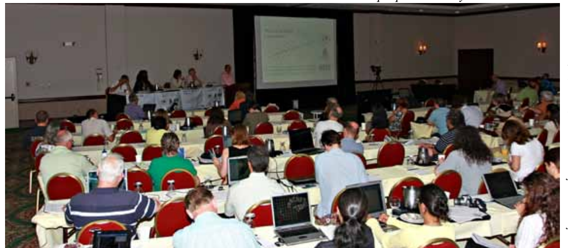
Valuable future exchanges lost?: Cayman Conference 2009 in session.

does welcome the greater awareness by this Government of UK Overseas Territories generally, and through the National Security Council, as well as the intention of (announced after the end of the reported year) to maintain an emphasis on UKOTs in its Darwin Initiative funding, and by the Foreign Commonwealth Office (FCO) and the Department for International (DFID) to continue the OTEP small project fund.