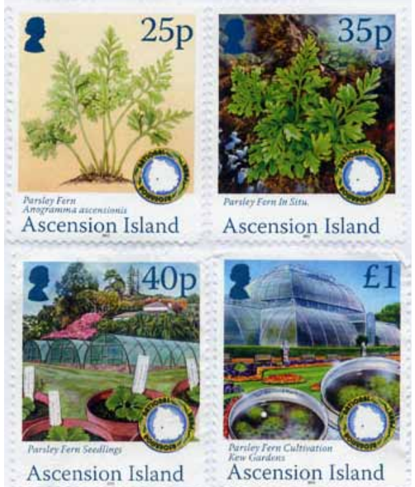
Ascension stamps commemorate the re-discovery and conservation of the Parsley Fern.

centre in the Green Mountain National Park, for the general public, visitors, researchers, scientists, students and school children on Ascension. The ground floor has been converted into a display area, on the Endemic Plants and South Atlantic Invasive Species projects, as well as other future exhibitions. Some of the posters collected at the UKOTCF-organised Cayman Conference in 2009 are displayed here. A section is to be utilised by the Heritage Society to demonstrate the historic significance of Ascension and promote and encourage people to use the walks and facilities available in the Park. There is also a small office on the ground floor, a workshop and storage area. The first floor has been converted into a lecture theatre and a class room facility. The regular newsletter from AIG Conservation Quarterly was published in June and December and is available to download at www. ascensionconservation.org.ac