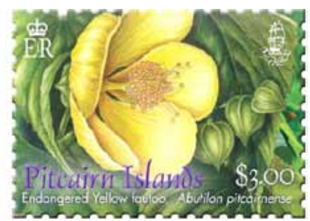
Pitcairn postage stamps featuring the Endangered Yellow Fatoo Abutilon pitcairnense