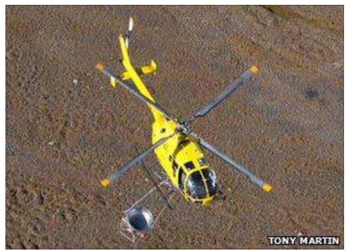
One of South Georgia Heritage Trust's helicopters disperses poisoned bait to remove rats from South Georgia, in order to reinstate native wildlife.

The species recovery work on Abutilon pitcairnense (yellow fautoo) continues at the National Botanical Gardens, Glasnevin, Republic