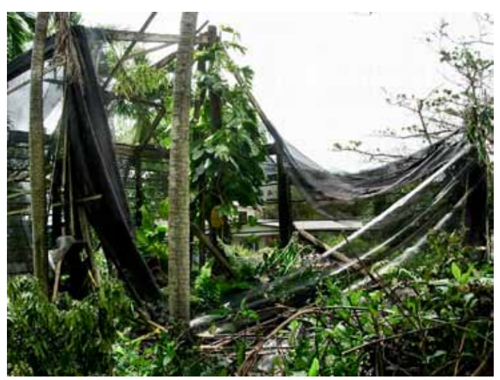
Damage to BVI's Botanic Gardens caused by hurricane Earl.

On a more positive note, after seven years of frustration and hard work by UKOTCF and its partners, the EU-funded Management of Protected Areas to Support Sustainable Economies (MPASSE) project finally got under way in 2010, with TCI hosting the first Steering Committee meeting in October. The project links work in TCI, BVI and the Cayman Islands, serving the dual purposes of conserving threatened ecosystems through improved management of protected areas and the development of enhanced facilities for ecotourism, demonstrating that intact habitats represent economic as well as environmental assets. Further details of this project are