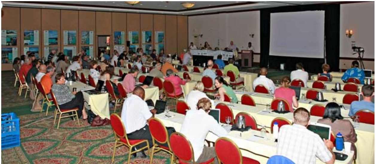
The conference in formal session and at the National Trust for the Cayman Islands event

Appendix 5. Friends of the UK Overseas Territories - the individual subscriber option for UKOTCF.