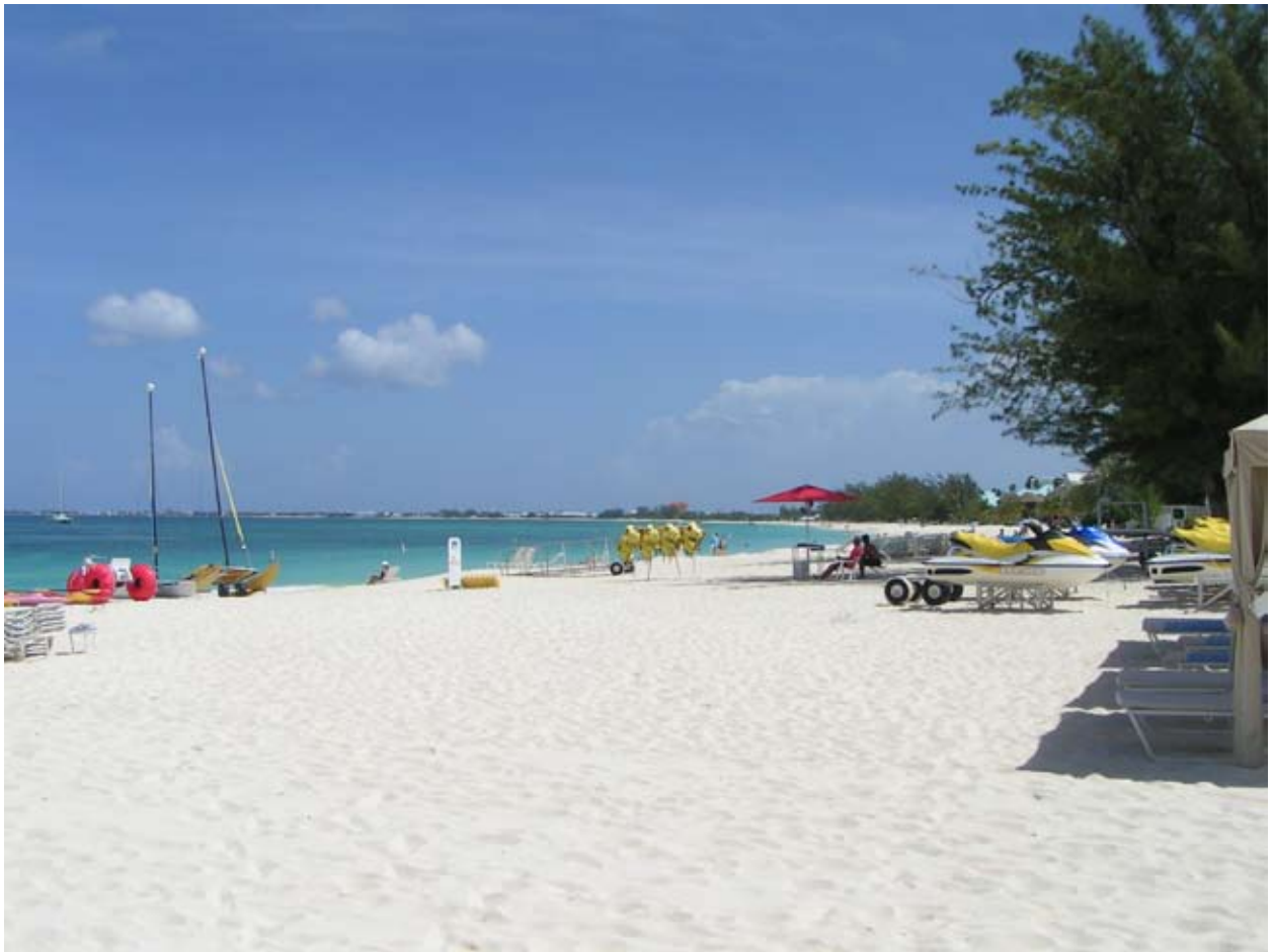
Some of the places in the conference venue that the conferences organisers never reached (Photos: Dr Oliver Cheesman - from a distance)