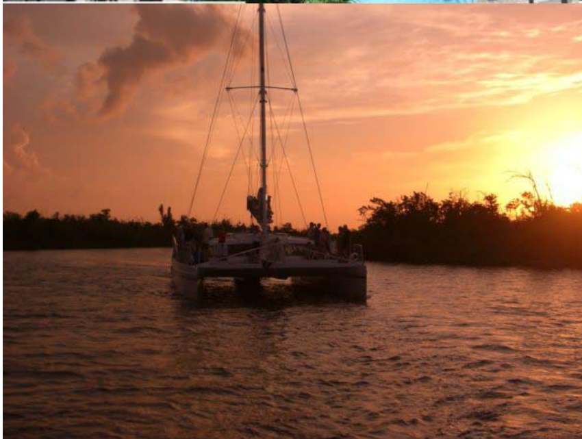
The closing session on the catamaran at sunset