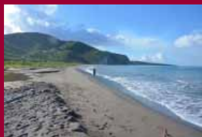
Isle Bay Beach Photo: Coastal Care Report

ship visitors about $1.60 each for the Environmental Protection Fund as part of their departure tax.