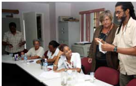
Participants at the Wonderful Water workshop in Grand Turk try out some practical tasks.