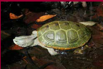
The diamondback terrapin is now protected under the new legislation.