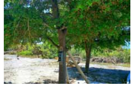
Rescue of a Shady Lady, by Environmental Arts: Photo: Turks & Caicos National Museum