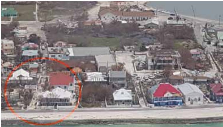
Aerial Photograph of Grand Turk just after Hurricane Irma. The Museum area is circled in red. The ruined botanic garden is on the left, with historic Guinep House in the foreground, and the science block behind.

The Museum Building, in the historic Guinep House, on Grand Turk, and the Science Building behind, were both damaged. The balcony and porch on Guinep House were blown away. Heat, high humidity, and lack of electricity meant that the exhibits, collections, and files remain were put at risk. Insurance will eventually help repair and replace some things. It will not cover the costs of damage assessment and conservation to the collections, exhibits, books, and files, or the ongoing costs for fuel to power generators. The Museum hopes to re-open in January or February 2018. Anyone wishing to help the Museum's recovery can donate via their webpage (see previous page)