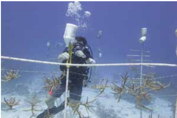
Coral nursery ladders installed by CCMI at Little Cayman'