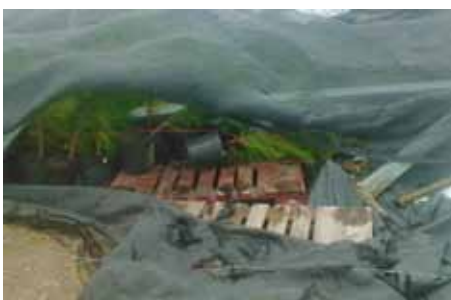
Left: Caicos pine saplings under the collapsed shade netting.

Instead of repairing the nursery, efforts are being focussed on completing the expansion nursery which had previously been partially started. Additional funding of about $8000 is sought to complete it. Please contact UKOTCF if you would like information on how you can support this work.