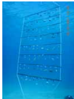
Right: A fully populated coral ladder.