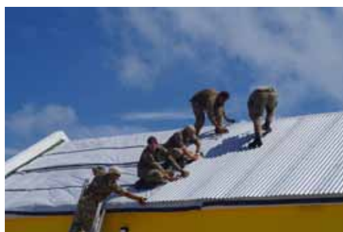
Right: Royal Marines repairing the roof of the Salt Cay airport building.