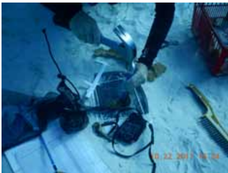
Left: Breaking a coral fragment into smaller pieces.

http://suntci.com/critically-endangered-corals-saved-after-hurricane-damage-p3058-106.htm