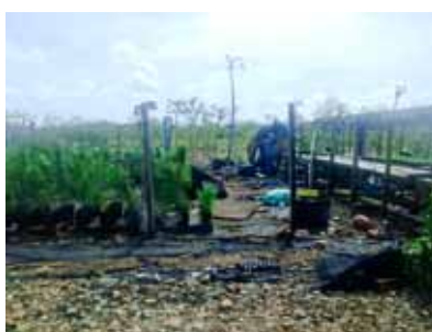
Left: Caicos pine saplings under the collapsed shade netting.