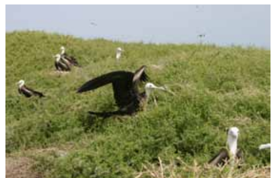
The frigatebird colony on Dog Island.