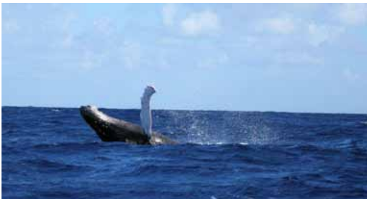
Humpbacked whale, Salt Cay.

Salt Cay was severely impacted, and struggled for many days with desperately short supplies of food and freshwater. A huge community effort, overseas fund-raising, aid from the UK military and TCIG, and re-connection to power supplies after 60 days (thanks to hard work by the Fortis team) has seen Salt Cay well on the way to recovery. Coral Reef Grill and Bar, Salt Cay Divers, and other local enterprises and accommodations are open for business. The humpback whale watching season is just around the corner, in January and February, so then would be an excellent time to visit. See the Spotlight on Salt Cay Facebook Page, Salt Cay Divers Facebook page, or email scdivers@tcway.tc for information.