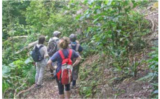
Blockages on the Oriole Trail caused by trees felled by Hurricane Irma.