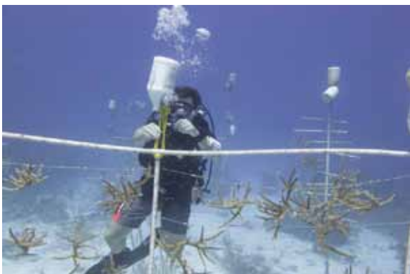
Coral nursery ladders installed by CCMI at Little Cayman'