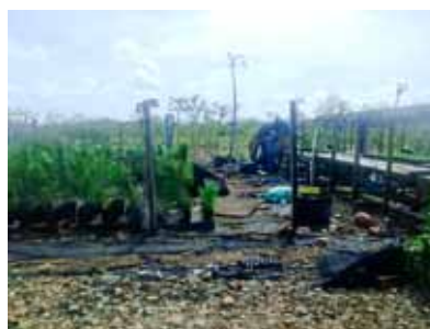
Right: The Caicos pine saplings being rescued after Hurricane Irma.