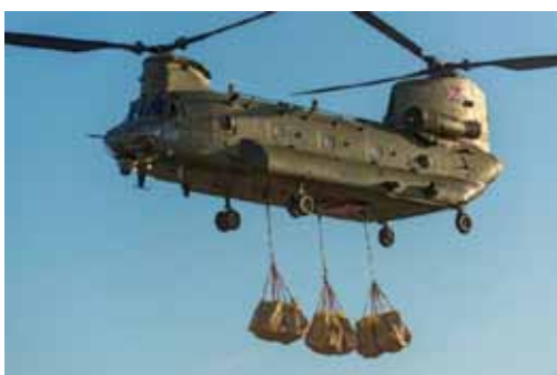
Left: Royal Air Force airlifting supplies to Salt Cay, TCI.

Hurricanes Irma and Maria severely affected 3 UKOTs at the same time, and this proved to be a logistical challenge for the pre-planned UK Government relief and contingency exercise. The military personnel did a great job, once they arrived on territory, but there were delays, especially in reaching TCI, over 700km from Anguilla and BVI. So a need has been identified to widen the scope of UK Governments strategy for hurricane and disaster relieve in the Caribbean UKOTs.