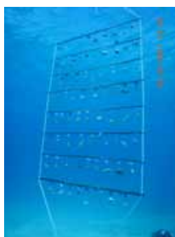
Left: Breaking a coral fragment into smaller pieces.