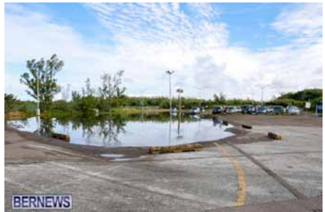
High tide flooding in Bermuda, on November 4th.

Bermuda has been experiencing very high tides recently, and a raised water-table due to a warm eddy around the island. Tides have been much higher than normal since September. This has led to flooding in a lot of inland wetlands, as well as coastal areas. These high tides and raised water-table are possibly a climate-change effect, although there is some evidence that it is cyclical: there were extreme high tides due to eddies in 2002 and 2011 as well. This happens when a warm eddy spins off the Gulf Stream and surrounds the island; warm water takes up more space, so tides rise. However, this current flood situation has lasted longer than previous occurrences. David Wingate noted that the 2002 event raised the water-table enough to drown the old Bermuda cedars in Paget Marsh, so it will be important to see what effect this one has on habitats. The usual consequence of a hurricane is actually a fall in sea temperature for a short time; the low pressure centre causes upwelling of colder deep ocean waters.