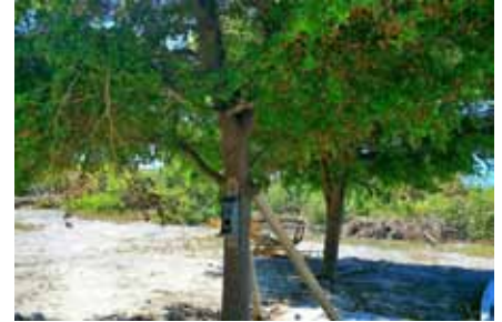
Rescue of a Shady Lady, by Environmental Arts: Photo: Turks & Caicos National Museum