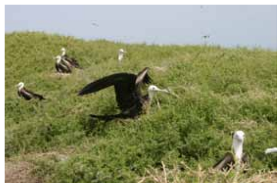
The frigatebird colony on Dog Island.