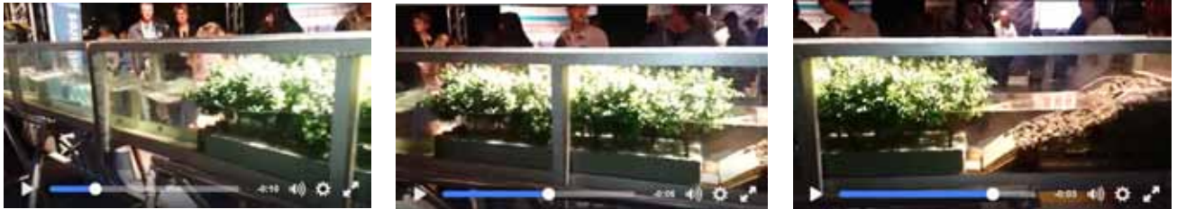
Screen grabs from the model mangrove demonstration video.

https://www.facebook.com/HollandinVietnam/videos/1336012163076583/