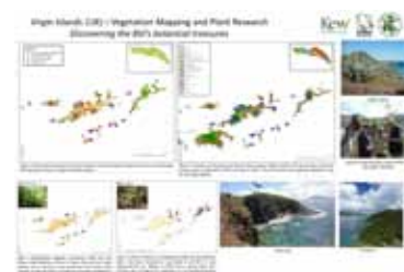
Some of the project outputs.

Ongoing field work with the Royal Botanic Gardens Kew is updating records of where endangered and invasive plant species are located. This project has made many new discoveries. For example Bastardiopsis eggersii , commonly called Jost Van Dykes Indian Mallow, is found in Puerto Rico and the Virgin Islands, but in BVI it was previously only known from Jost Van Dyke. Its range has now been extended to 7 more islands in BVI.