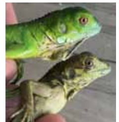
Green iguana hatchling (top) and one of the possible hybrid hatchlings (below)

https://cnslocallife.com/2016/09/new-plan-get-rid-green-iguana/