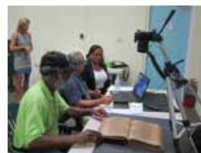
Hon. Josephine Connolly, Deputy Speaker of the House, on her visit to the museum, observing how the historical records are being digitized.

www.facebook.com/TurksCaicosNationalMuseumFoundation/