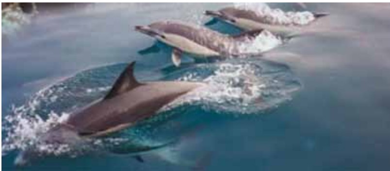
Dolphins in the Straits of Gibraltar