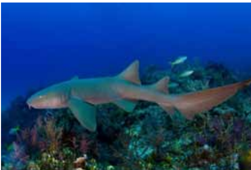
A nurse shark in the waters off BVI.

The British Virgin Islands recently became the third in the Caribbean (after Honduras and the Bahamas in 2011) to declare a shark sanctuary. The decision was made official on May 22 2014. The designation protects rays also.