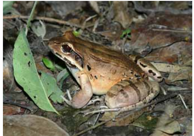
Mountain Chicken.