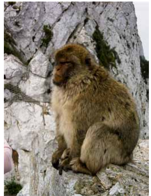
Barbary macaque on the Rock of Gibraltar

Iconic species, like Barbary macaque and dolphins can be important in sustainable tourism, environmental education & awareness, and informed decision making regarding sustainable development.