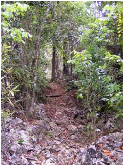
The Mastic Trail

The original gazetted route for the east-west arterial road across Grand Cayman would have had a very detrimental effect on National Trust for the Cayman Islands properties, including the Mastic Trail, Salina Reserve and Colliers Wilderness Reserve. The first stage of the proposed East-West Arterial Corridor would have affected the Mastic Reserve and a portion of the Central Mangrove Wetland. The more easterly part of the road would impact the Salina Reserve and Colliers Wilderness Reserve, protected areas where the endangered blue iguanas are released. The development of sustainable visitor facilities at the latter is receiving funding from the EU under the “ Management of Protected Areas to Support Sustainable Economies (MPASSE) ” project.