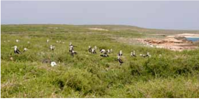
Frigatebirds on Dog Island, before the rat eradication programme.