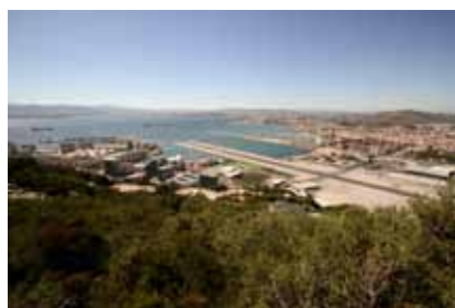
A view of Gibraltar harbour and airport from the Rock.

The Conference – “Sustaining Partnerships”, with the theme of conservation and sustainability in UK Overseas Territories, Crown Dependencies and other small island communities, will be held in Gibraltar from 11th to 15th July 2015.