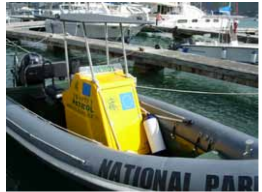
The patrol boat purchased as part of the MPASSE project, whose application to the EU for funding was coordinated by UKOTCF.

NPTVI is a cross territory partner with the Turks and Caicos National Trust, the National Trust of the Cayman Islands and the UKOTCF on a European Union funded project entitled, 'Management of Protected Areas to Support Sustainable Economies'. This project started officially in 2009 and will end on December 31 st 2014, but within these last four months the majority of the project activities will finally take place! Three visitor centres will be constructed on three islands, including Sage Mountain National Park on Tortola; the Copper Mine National Park on Virgin Gorda and the Anegada Rock Iguana Headstart Facility on Anegada. A section of the historic ruins at the Copper Mine National Park will also be restored and interpretation and signage developed for the three visitor centres. An article about the MPASSE project can be seen in Forum News 37 ( www.ukotcf.org/pdf/fNews/37.pdf )