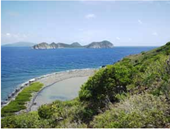
View of Ginger Island, taken on Cooper Island, whilst mapping plant species as part of the Darwin Plus project being undertaken by RBG Kew and NPTVI. Ginger Island has also been assessed as part of this project.