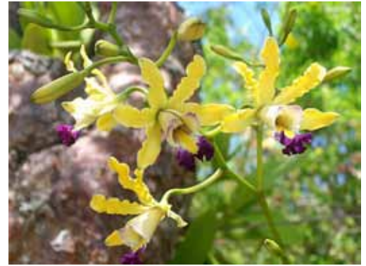
The National Flower of the Cayman Islands, the banana orchid.