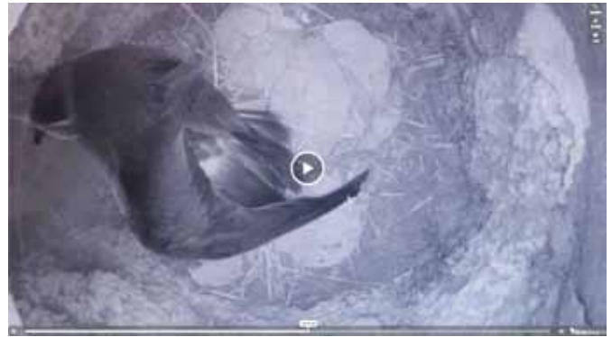
Cahow chick on the 28 May 2014, just before leaving the nest. Screen shots from the infrared burrow cam, developed by JP Rouja of LookTV (see below)

The main threats to cahow include the erosion and flooding of the present nesting islets by storm activity and continuing sea-level rise, predation by rats and other invasive species swimming to these islets, a lack of sufficient numbers of suitable nest-burrows or rock-crevices, and nest-site competition with the longtail or white-tailed tropicbird Phaethon lepturus catsbyii .