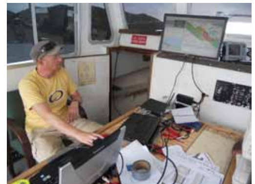
Hydrographic surveyor working with United Kingdom Hydrographic Office on the National Parks Trust vessel whilst conducting high resolution bathymetry surveys this July/Aug 2014.

This summer the Cefas team spent six weeks mapping an area of the Sir Francis Drake Channel from the Wreck of the Rhone Marine Park across to Hans Creek, Beef Island using a Cefas-owned Multibeam Echosounder (MBES) system mounted on the NPTVI vessel. An underwater camera system also collected video and still images of the seabed. The imagery will be analysed by the Cefas team back in the UK and maps will be produced to display benthic habitat types. This data will be shared with the BVI's National GIS network for multi-department use and the direct management of marine resources. NPTVI hopes that greater areas of the BVI's seabed can be mapped using this technology, revealing an insight into the diverse underwater resources that are yet undiscovered.