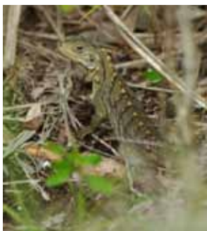
The first wild hatchling of 2013 in the Colliers Wilderness Reserve

Forty-nine blue iguanas reared in captivity were recently released into protected areas, 20 into the Salina Reserve and 29 into the Colliers Wilderness Reserve. This was a smaller number than previous releases, as the programme is currently focusing on genetic diversity.