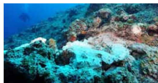
Reef damage caused by the illegal anchoring of the mega yacht White Cloud

http://www.tcnewsnow.com/news/newspublish/home.print.php?news_id=6500