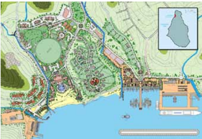
Master Plan for the new capital city development The port area on the RHS is in Carr's Bay. Montserrat Development Corporation

After the destruction of Montserrat's capital, Plymouth, by the eruption of the Soufriere Hills volcano in 1997, plans have been evolved for a new capital city in the northern part of Montserrat. The area around Little Bay was decided upon, and developments in this area have been ongoing for several years. However, there has been considerable discussion, and indeed change of plans, about the coastal area. It has now been determined that the Carr's Bay area will be the site for the cruise ship port and part of the development of the new town centre. Gun Hill may be partially demolished to allow for the new port development to take place, and Piper's Pond will be greatly impacted. The Montserrat Development Corporation (MDC) say they are doing everything possible to ensure that the cannons, currently at Carr's Bay, will be removed and later re-incorporated into the new town development's waterfront location.