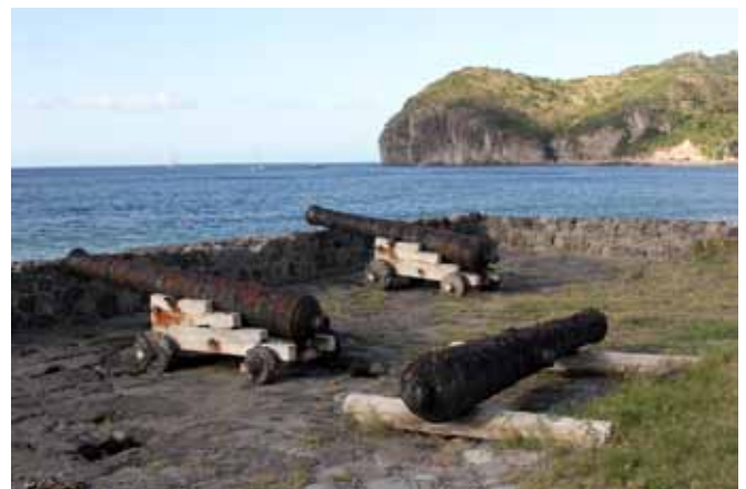
Carr's Bay Cannons