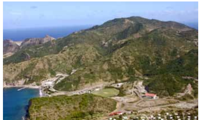
The new capital city development area, 2012. The flat green circle in the centre is the cricket ground.

Interesting points in the presentation are the decision to limit the size of cruise ships which can be accommodated and the need to have a distinctive architectural style, and maintain control of this. The presentation also informs that the MDC are working with the Department of Environment, and it is planned that the mangroves at Pipers' Pond will be kept, as part of a mangrove reserve and botanical garden.