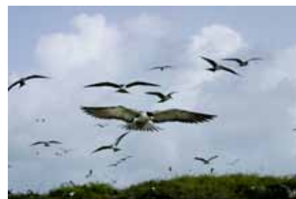
Sooty Terns, Dog Island, Anguilla

WCWG has reported on the progress of the Rat Eradication Project on Dog Island, a proposed Wetland of International Importance under the Ramsar Convention and one of the Caribbean's most important seabird islands, with nine breeding species including sooty terns, brown boobies, laughing gulls, magnificent frigatebirds, brown noddies, masked boobies, and red-billed tropic birds (see WCWG eNewsletters 6, 8 ). Regular monitoring since the end of the rat eradication programme has