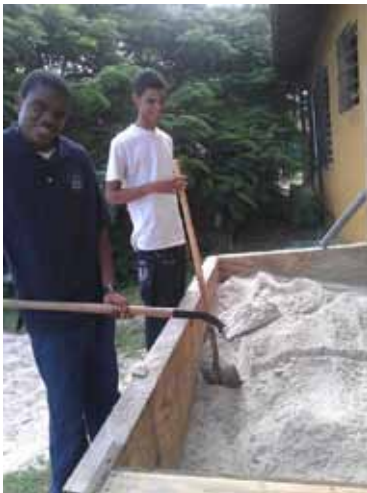
Sand for Sale

The effect of sand-mining on coastal ecosystems in the Caribbean can be devastating, and many Caribbean countries, including Anguilla, have legislation to control sand-mining. Sand-mining in Anguilla is illegal and sand-mining activities are punishable by law under Anguilla’s Beach Protection Act, but it still occurs across the island. The effect of illegal sand-mining on the beaches of Anguilla has been highlighted previously by the Anguilla National Trust. While in some instances, sand has been removed from a number of beaches through the use of backhoes and trucks, there are also many cases of sand being removed by individuals by bucket. The latter may be due to the difficulty in obtaining the smaller amounts of sand that may be needed for small-scale construction. Therefore, in an effort to reduce illegal sand-mining activity, the Anguilla National Trust is currently selling sand, sourced legally outside of Anguilla from a reputable retailer, at cost, to individuals who require relatively small amounts of sand for construction purposes. This enterprise is part of the Save the Sand Campaign, a public-private initiative with the Sand Bar and the Anguilla National Trust. Save the Sand seeks to raise awareness about the importance of protecting and preserving Anguilla’s coastal resources, especially the beaches.