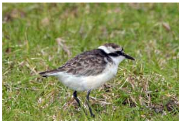
St Helena wirebird or plover Charadrius sanctaehelenae.

Various ecological considerations had to be addressed throughout the airport project. As there is very little flat land on St Helena, choosing the airport site was challenging. It was finally decided that Prosperous Bay Plain would be the site. This is the only desert-like habitat on the island and is therefore a site that is very important ecologically. One ecological issue that had to be addressed by the project was the fact that the site is a significant habitat for the wirebird, St Helena's only endemic bird. While the airport construction plan