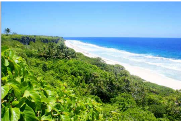
Henderson Island, Pitcairn.

An RSPB expedition team landed on Henderson Island on 22nd May 2015 in order to commence a six-month research expedition. The team set out from Pitcairn Island and, upon arrival on Henderson, spent the next two days unloading research equipment ready to commence work into better understanding the ecology of the island. The team worked until the end of August, so as to gather data on the vegetation, rats, seabirds and landbirds of Henderson.