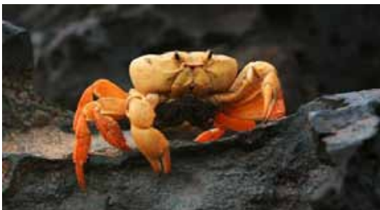
The land crab Johngarthia lagostoma is one of two invertebrates on Ascension Island with an action plan.

www.ascension-island.gov.ac/government/conservation/projects/bap/