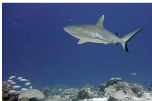
A grey reef shark spotted while some of the team were diving.

The Darwin 2015 Chagos Expedition is the third of a series of three, the purpose of which has been to achieve the objectives of a Darwin Initiative project Strengthen the World's Largest Marine Protected Area, Chagos Archipelago . The main aim of this three-year project is to provide scientific knowledge for effective management which will allow the Chagos Marine Protected Area (MPA) to be strengthened. It will also allow the development of a strategy that engages with potential stakeholders.