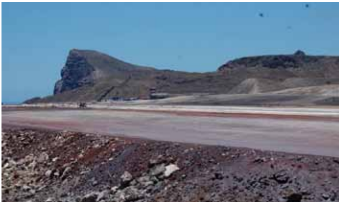
Airport site, Prosperous Bay Plain 15/01/2015.