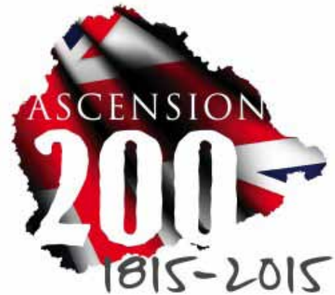
The Ascension Island Bicentenary logo.

A program of events has been planned for the whole Island community to celebrate this special Bicentenary year. The Bicentenary Weekend will be held from 22-25 October 2015, with events including; a concert with the Royal Marine Band, a flag raising ceremony, and the official opening of the Bicentenary Park. We hope that this special occasion runs smoothly and we look forward to seeing lots of photos!