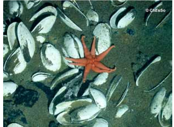
Eight-armed starfish on the East Scotia Ridge.

An international team of scientists has published an article in the April 2015 edition of the Zoological Journal of the Linnean Society to report the incredible discovery of a new family of deep-sea starfish. These were discovered in the warm waters surrounding a hydrothermal vent in the East Scotia Ridge, Antarctica. This starfish family, known as Paulasterias tyleri , is unusual in that specimens have six or eight limbs as opposed to the usual five.