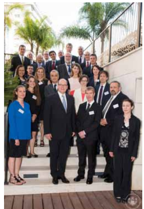
The Monaco Assessment Group with HSH Prince Albert II of Monaco.

One outcome of this meeting was The Monaco Assessment . This is a statement by the meeting participants, on conservation in the Antarctic and Southern Ocean region in the context of the Strategic Plan for Biodiversity 2011-2020. Another aim of the meeting was to provide guidance for action that can aid in the delivery of conservation successes in the Antarctic and Southern Ocean region. A further goal was to identify key work areas and indicators to provide guidance for this work.