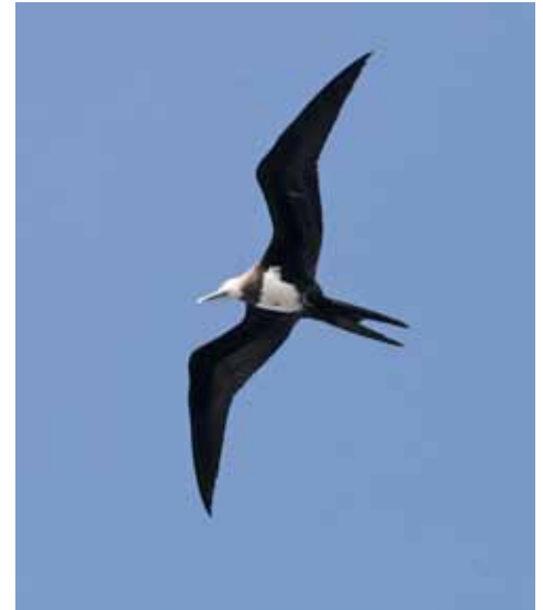
Male Ascension frigatebird (above) and immature Ascension frigatebird (left).