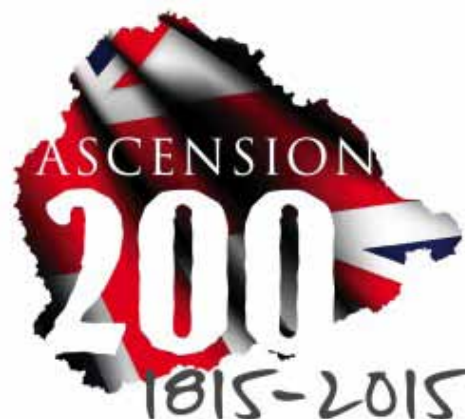
The Ascension Island Bicentenary logo. Ascension Island Government.

A program of events has been planned for the whole Island community to celebrate this special Bicentenary year. The Bicentenary Weekend will be held from 22-25 October 2015, with events including; a concert with the Royal Marine Band, a flag raising ceremony, and the official opening of the Bicentenary Park. We hope that this special occasion runs smoothly and we look forward to seeing lots of photos!