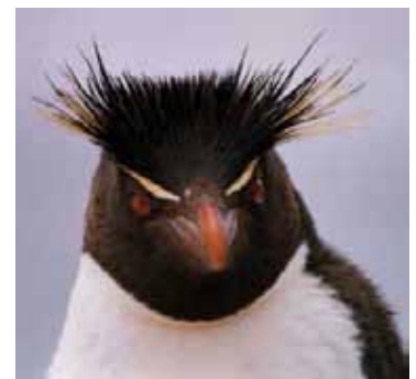
Southern Rockhopper Penguin.

www.south-atlantic-research.org/media/files/GAPNewsletter_Issue2.pdf