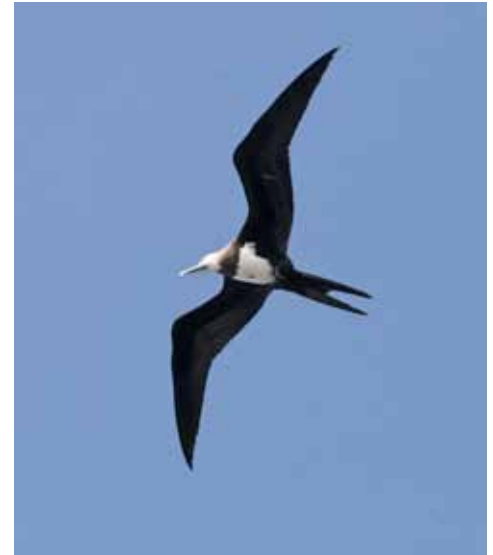
Male Ascension frigatebird (above) and immature Ascension frigatebird (left).