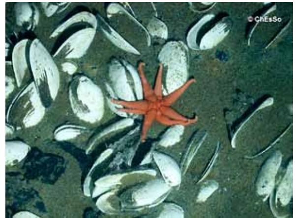
Eight-armed starfish on the East Scotia Ridge.

An international team of scientists has published an article in the April 2015 edition of the Zoological Journal of the Linnean Society to report the incredible discovery of a new family of deep-sea starfish. These were discovered in the warm waters surrounding a hydrothermal vent in the East Scotia Ridge, Antarctica. This starfish family, known as Paulasterias tyleri , is unusual in that specimens have six or eight limbs as opposed to the usual five.