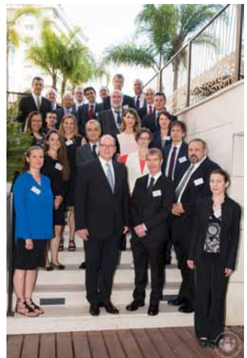
The Monaco Assessment Group with HSH Prince Albert II of Monaco.

One outcome of this meeting was The Monaco Assessment . This is a statement by the meeting participants, on conservation in the Antarctic and Southern Ocean region in the context of the Strategic Plan for Biodiversity 2011-2020. Another aim of the meeting was to provide guidance for action that can aid in the delivery of conservation successes in the Antarctic and Southern Ocean region. A further goal was to identify key work areas and indicators to provide guidance for this work.