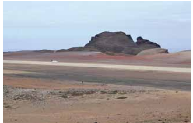
First plane landing, 15/09/2015.

Tuesday 15th September 2015 is a memorable day for St Helena. On this day, the first plane landed at St Helena's new airport – an incredibly historic moment. The aircraft in question was a Beechcraft King Air 200 which had flown over from Angola. Calibration tests were then conducted, with the final test completed on the 23rd September. An assessment of the test findings will now be made.