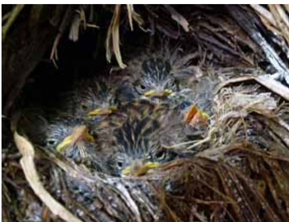
The first South Georgia pipit nest discovered in a place cleared of rodents thanks to the Habitat Restoration Project.

In March 2015, rodent bait was deposited for the last time as part of the South Georgia Habitat Restoration Project. The project had involved more than 800 loads of bait and three seasons of fieldwork. During this time, more than 1000 km 2 of land was treated. It is amazing to think that South Georgia may now be free from such destructive invasive species, which should have never been there in the first place.