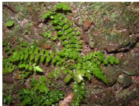
The Ascension Island spleenwort Asplenium ascensionis has a Species Action Plan.

For now, the BAP focuses on priority species, habitats and ecosystems requiring conservation action. This is due to limited resources and time. The BAP therefore currently targets 13 endemic and indigenous species, including the Ascension Island frigatebird (see article on p3) and