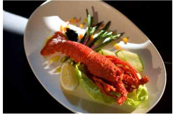
Tristan lobster is on the menu.

The Tristan lobster has travelled far afield and is now available in Central London restaurants. This famous Tristan rock lobster can be found at Roka, a group of Japanese restaurants found in the city centre, as well as in the Little Chelsea Fish Market, Kensington. Visitors can enjoy the shellfish in a variety of dishes including sashimi, tempura and with linguine! Selfridges on Oxford Street has also stocked the lobster since February 2015.