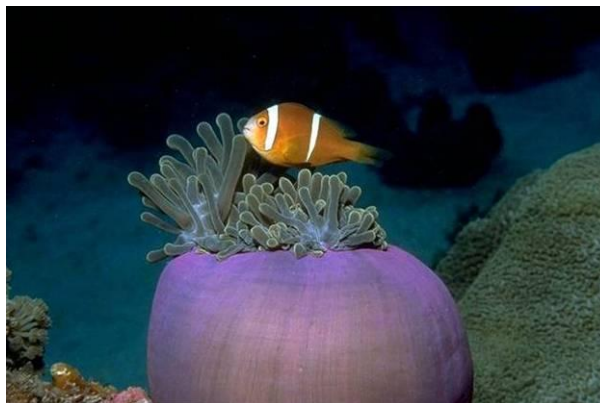
An endemic BIOT Clown fish.