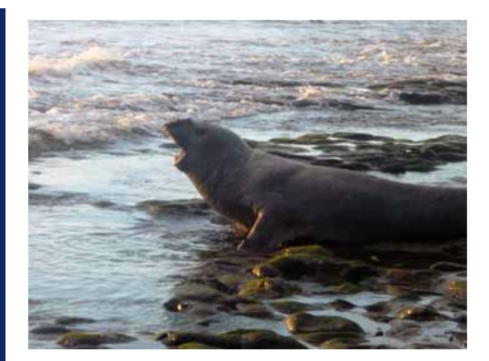
Sea elephant on Flat Rocks, 13 July 2016