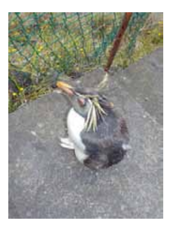
Northern Rockhopper Penguin on the steps to Runaway beach

provide a few examples of recent sightings here: