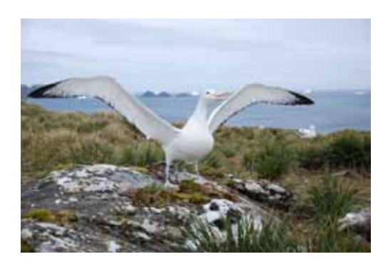
Male wandering albatross

The journal Biological Conservation has recently published a review of threats and conservation actions required for the 29 albatross and large petrel species that are covered by the Agreement on the Conservation of Albatrosses and Petrels (ACAP). The study indicates that there were declines in the global population numbers in 38% of the species, between 1993 and 2013.