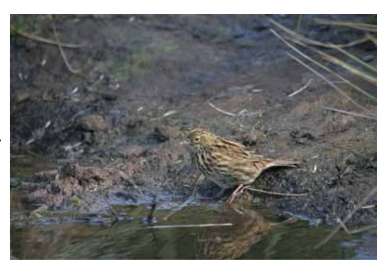
South Georgia Pipit, with tiny food item from the water

The population numbers approximately 3000 to 4000 pairs at present. Food sources consist primarily of invertebrates, including small insects and marine invertebrates from the tideline. The latter source is consumed particularly when the ground is covered in snow.