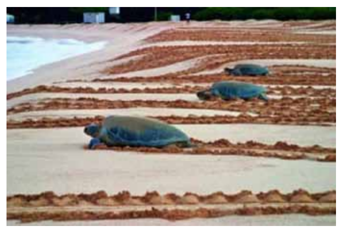
Turtles returning to the sea among dozens of tracks made during the previous night