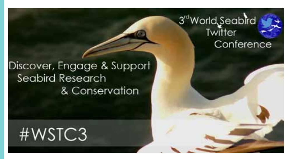
World Seabird Twitter Conference : this year's conference will be the third in the series organised by the World Seabird Union.

This year's World Seabird Twitter Conference (#WSTC3) will be held from 12-14th April 2017. The conference is a low carbon, free science communication event held on Twitter. Seabird researchers, conservationists and NGOs from all over the world will share their work in 6 tweets. Last year's conference was a huge success with a reach of more than 2 million people. This year's event will feature new additions including invited plenary speakers and expert panel Q&As. Anyone interested in seabirds that would like to join the conference and discussion can do so by following the hashtag #WSTC3 on Twitter. Further details can be found at <a href="http://seabirds.net">http://seabirds.net</a>