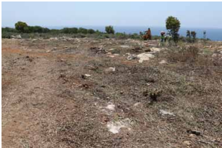
Acacia clearance in Cape Pyla.

Since November 2014 more than 54 acres of acacia have been removed by the SBA authorities as part of efforts to curb bird poaching in Cyprus SBAs. Plans are in place to remove the remaining 90 acres over the next few years. Acacia saligna is a fast-growing invasive species which is difficult to control; saplings are planted by illegal bird poachers to conceal mist nets. The environment department has tested various methodologies for its removal, including working with the MOD's forestry department and chemical control of stumps. In October, it was announced that SBA authorities were doubling the number of officers involved in the targeting of illegal bird trapping activities, to tackle the problem of songbird poaching in the SBAs.