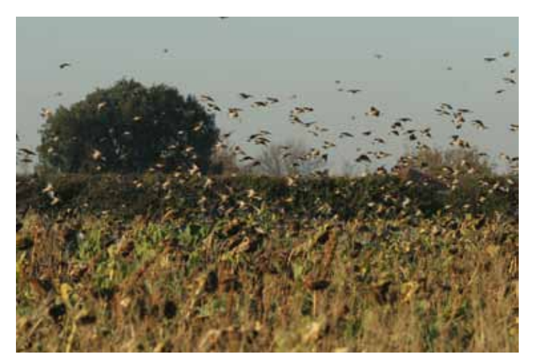
Winter Bird Crops.

Jersey's Birds on the Edge project continues its work to restore habitat along the island's coastal heathland and grassland. The project works closely with the farming community to establish sacrificial crops and supplementary feeding over the winter. The project's Winter Bird Crop Report for the 2015-2016 year shows just how important these crops are for threatened local and migrant species, with an increase in bird numbers at the crops of almost 40% (birds/hectare). The majority of birds feeding at the crops were the targeted species: farmland birds such as chaffinch, linnet, reed bunting, meadow pipit, goldfinch and starling. The planting of winter crops in Jersey has been funded by local charity Action For Wildlife, the States of Jersey's Countryside Enhancement Scheme as well as private donations.