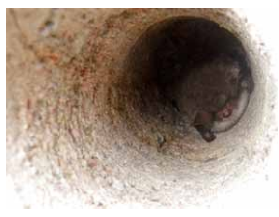
Natterer's bat hibernating in the Essex caves, Alderney.

A new species of bat has been found in Alderney, the second in a period of 6 months. Jersey Bat Group discovered a Natterer's bat (Myotis nattereri) hibernating in a cave on the island during a visit in February. This follows the discovery of another new species, a Whiskered bat, in November last year. Although Natterer's bats are present on