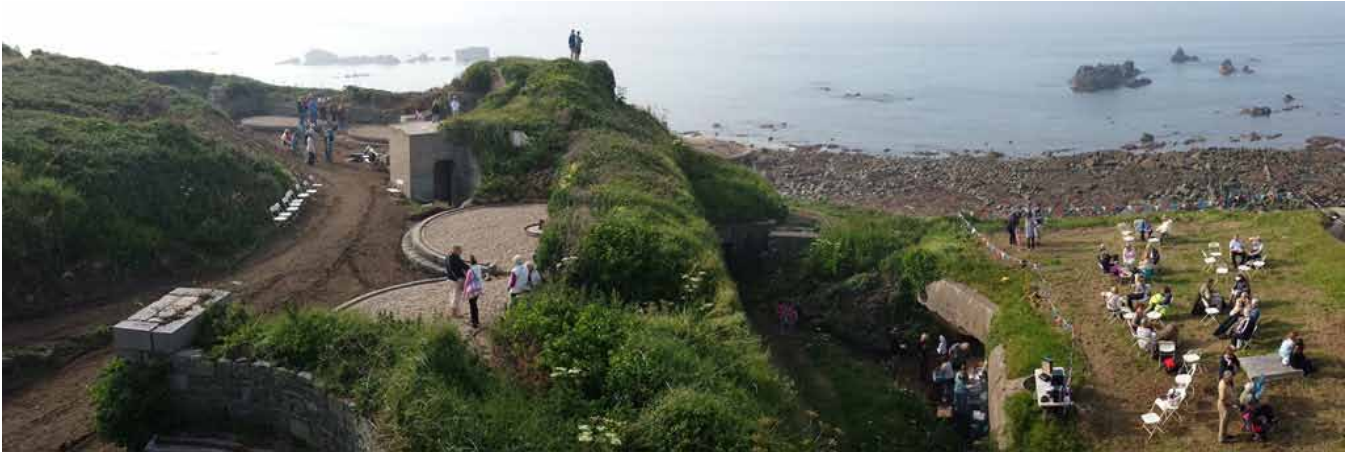
The opening ceremony at Fort Tourgis on Alderney