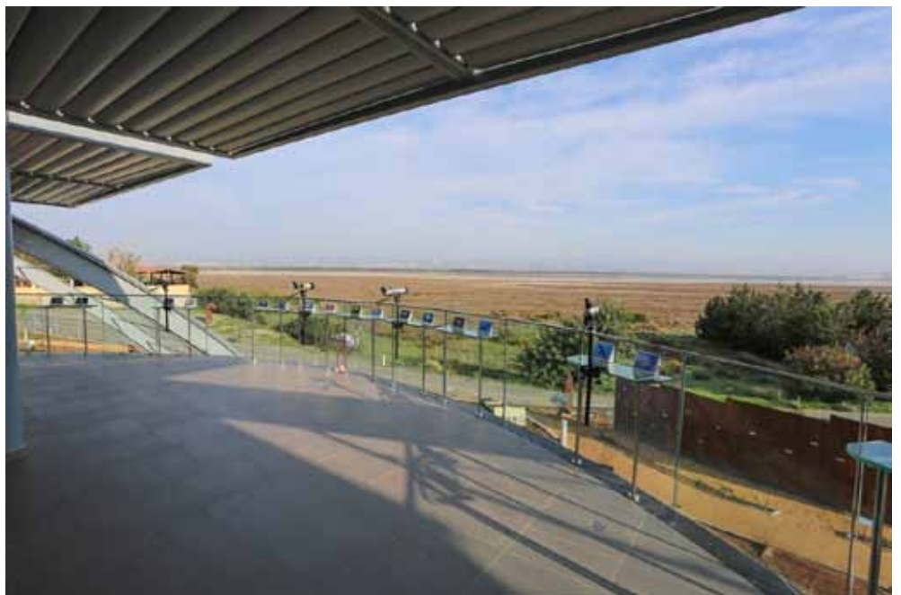
The state-of-the-art new Environment Education Centre and the view from its observation platform