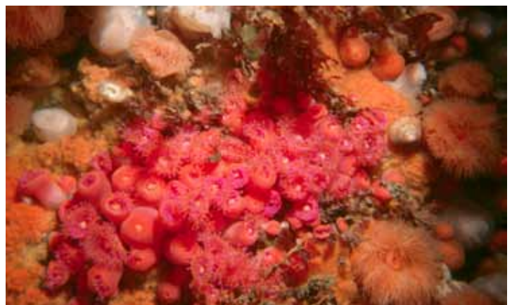
Jewel anemones in the water off the Calf of Man