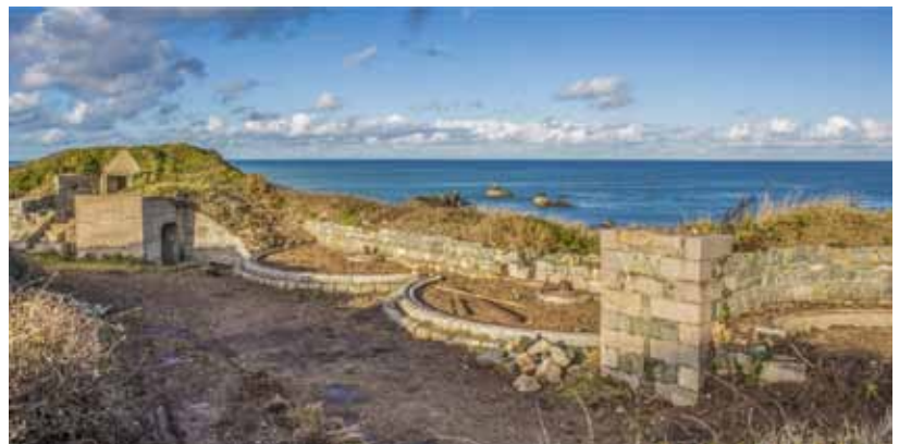
Cambridge Battery at Fort Tourgis

Living Islands, a two year collaborative project between the States of Alderney, The Alderney Society and Alderney Wildlife Trust, is well underway. It aims to promote the natural history and heritage of Alderney to new audiences, whilst also engaging local communities. Alderney is rich in natural and historical assets, and the project seeks to harness the value of these to support the economy and provide opportunities for islanders.